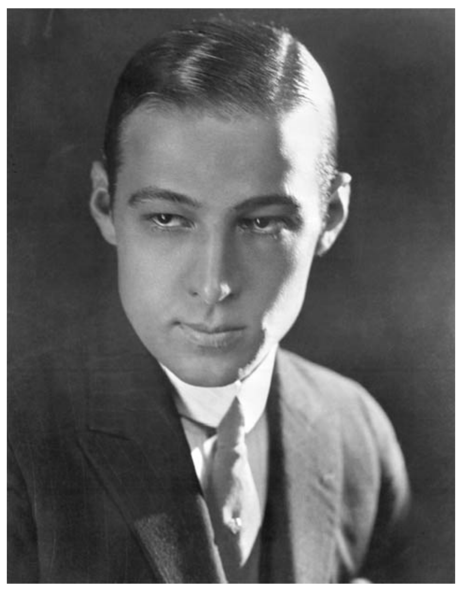
Figure 2.1. Rudolf Valentino, actor, 1920s.

developed nations, there is substantial agreement on what constitutes human beauty. I asked three women, ages twenty, thirty-five, and sixty-five, who the sexiest men in the world are today. All three included George Clooney in their list. Having presented his picture and those of a number of other men, including Asian and American politicians and actors, to audiences in the United States, Asia, Australia, and Europe, I am certain that there is nearly universal agreement that George Clooney is considered better-looking than almost anyone else.