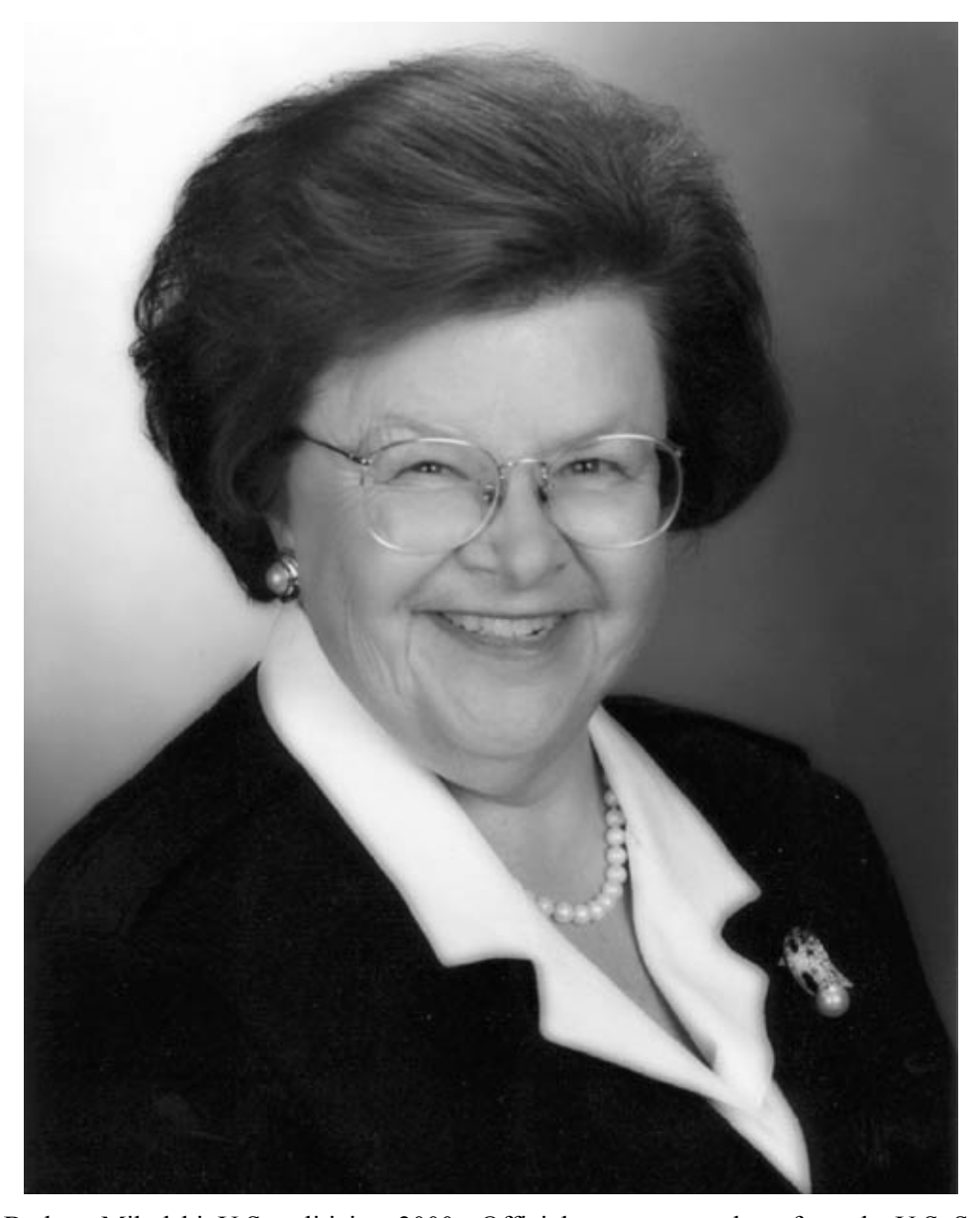
Figure 2.4. Barbara Mikulski, U.S. politician, 2000s.