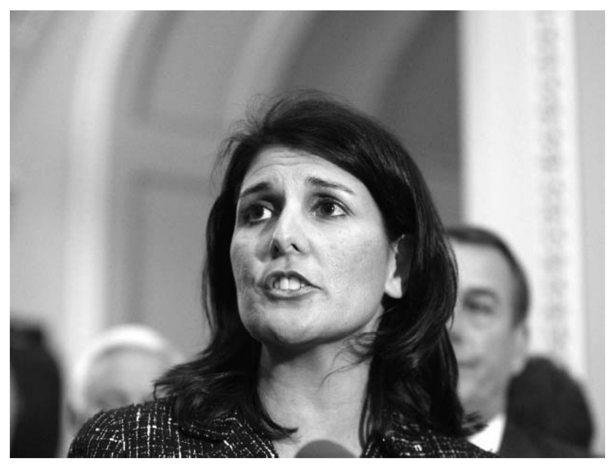
Figure 2.3. Nikki Haley, U.S. politician, 2000s.

Cultural differences do still exist. A recent report on a "fat farm" in Mauritania, one of the poorest countries in the world, illustrates their persistence.<sup>4</sup> This is not the kind of "fat farm" to which rich North Americans retreat to lose weight, but one where young girls are fed, and even force-fed, to produce rotund young adults who are viewed as attractive. But even this unusual cultural difference appears to be diminishing in importance as Mauritania industrializes and becomes more integrated with the outside world.<sup>5</sup>