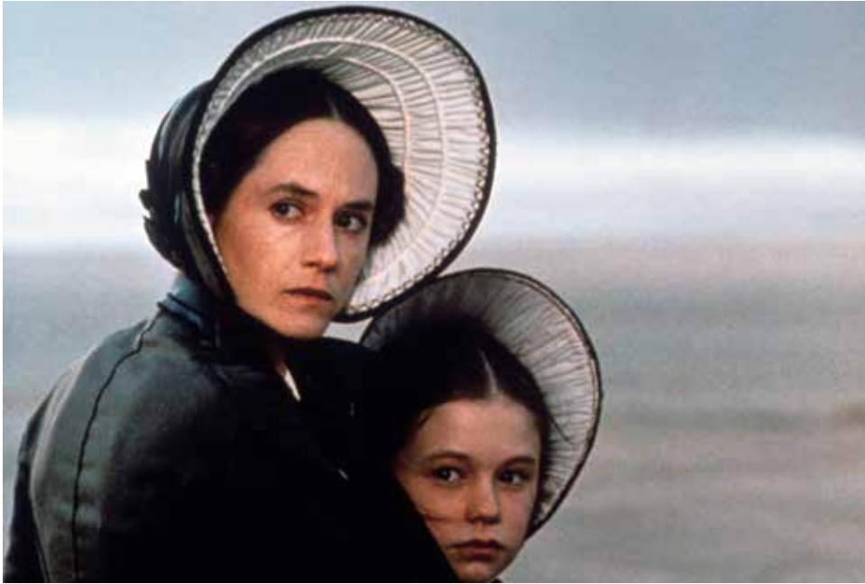
The mute Ada (Holly Hunter) and her daughter Flora (Anna Paquin).

ties of explaining to a composer what was desired, especially when directors often have little music knowledge. She recalls that “when composers discuss music with someone as primitive as myself, they have to talk about it in terms of senses and emotion, rather than keys and tempo. When I wrote the screenplay, even though the piano is an integral character, I heard no music in my head at all.” Campion let Nyman work and then asked if he could make a certain cue happier or sadder. After much deliberation, Nyman decided that Scottish folk songs would be a good inspiration, given that Ada was arriving from Scotland.