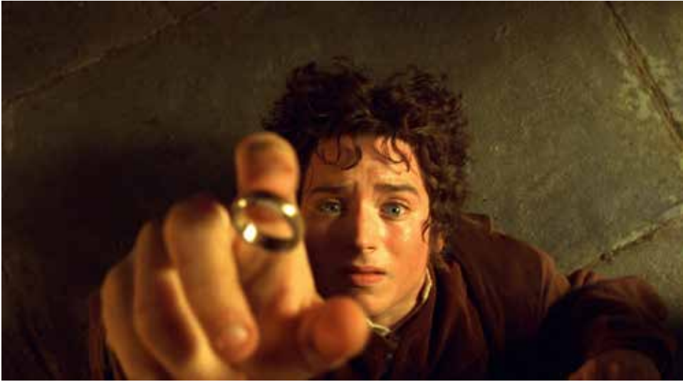
Elijah Wood as Frodo Baggins.

The first film, highlighted in this chapter, was The Fellowship of the Ring , released in December 2001. It had a budget of $93 million and grossed $871 million worldwide.