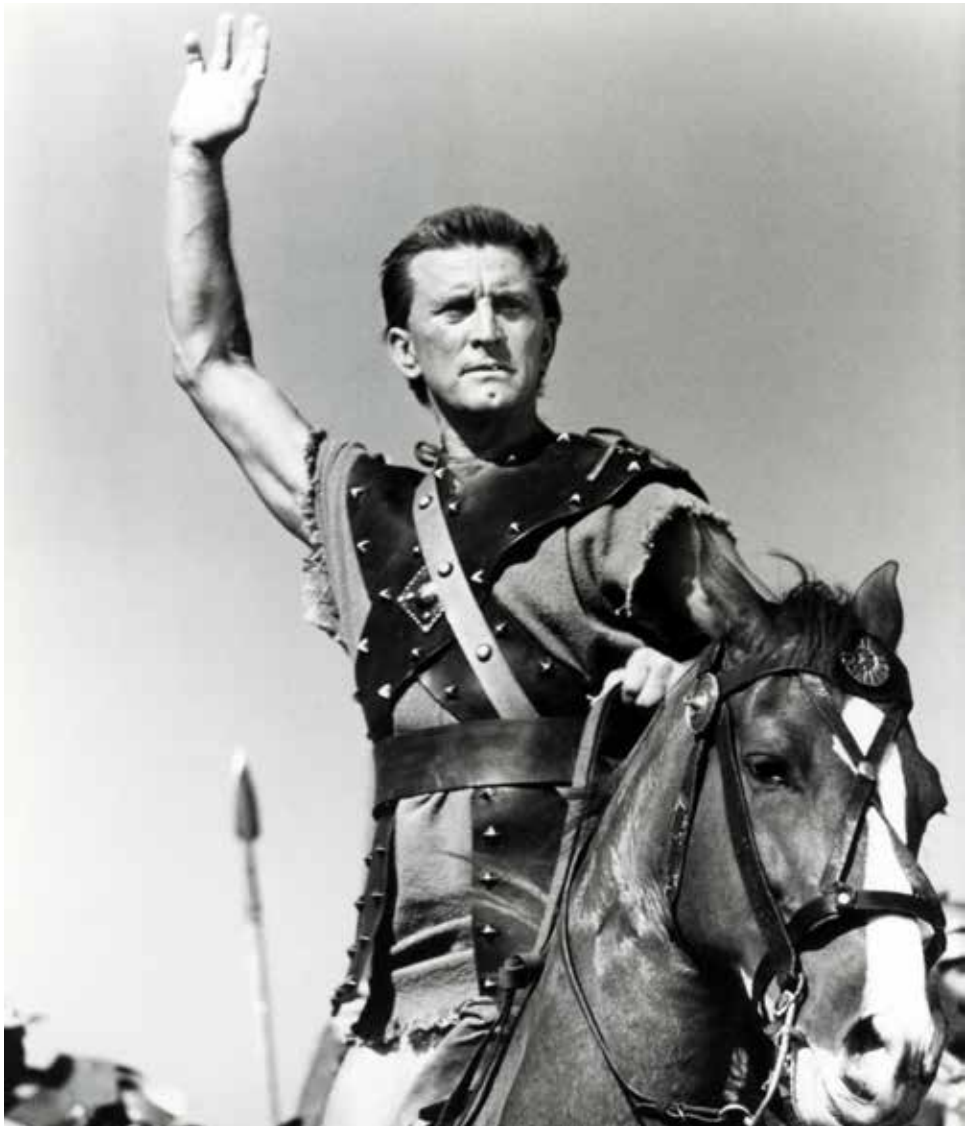
Spartacus (Kirk Douglas) leads the revolt against the Romans.

that he threw away more pages of music than ever before. It was a genuine challenge and a labor of love for the talented composer. North had been more accustomed to composing jazz scores, so Spartacus , with its epic scale, was a challenge. The composer re-created the sounds of Rome not by resorting to musical clichés, but by writing in a contemporary, modern style that would enable him to experiment with exotic instruments. These instruments included a sarrusophone, Israeli recorder, Chinese oboe, lute, mandolin, Yugoslav flute, kythara, dulcimer,