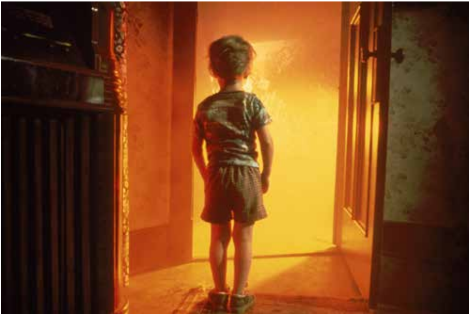
Barry Guiler (Cary Guffey) welcomes the arrival of aliens.

Close Encounters begins with the discovery by a team of scientific researchers of World War II-era bombers in a desert area of northern Mexico. The film then shifts to the American Midwest where an air traffic controller in Indianapolis spots UFOs on his radar screen. Soon thereafter, sightings of alien spacecraft near Muncie, Indiana, deeply affect a power company lineman, Roy Neary (Richard Dreyfuss), and an artist and single parent, Jillian Guiler (Melinda Dillon). Roy becomes obsessed with finding out who these aliens are, while Jillian frantically tries to find her young son, Barry (Cary Guffey), who gets abducted by the extraterrestrials. Following their close encounters, these ordinary people become witnesses to a series of extraordinary events.