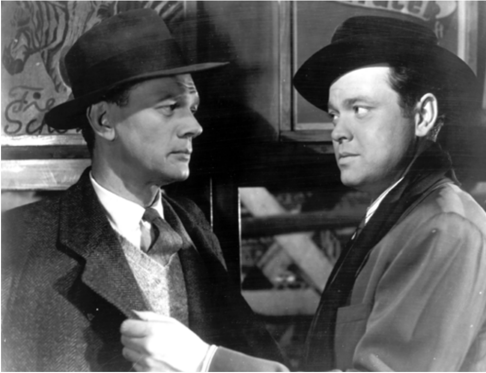
From left: Holly Martins (Joseph Cotten) and the third man, Harry Lime (Orson Welles).

unseen zither-player . . . is made to employ his instrument much as the Homeric bard did his lyre." Another reviewer claimed that the real hero of the film was the unseen zither player.