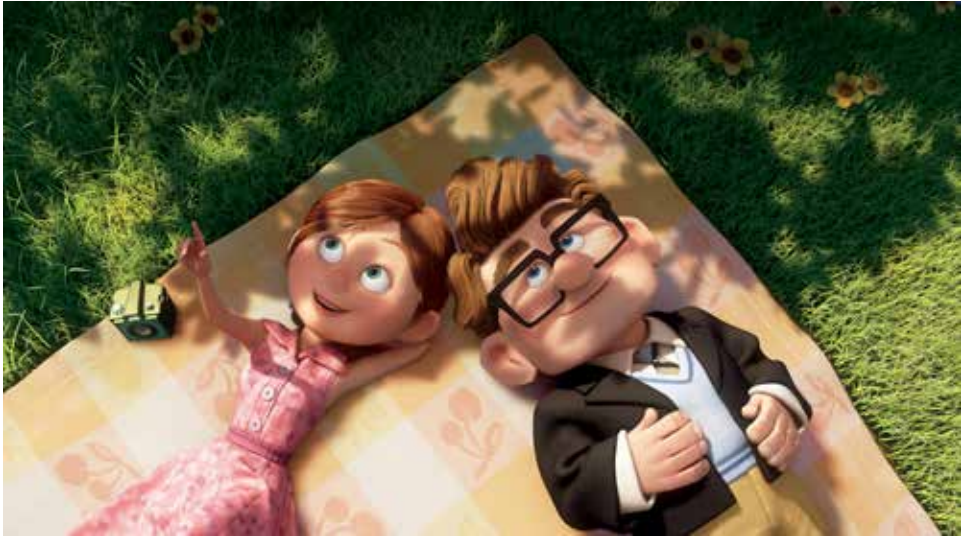
Ellie and Carl in their younger years.

style, as these themes change style and orchestration depending on the situation the character is in.