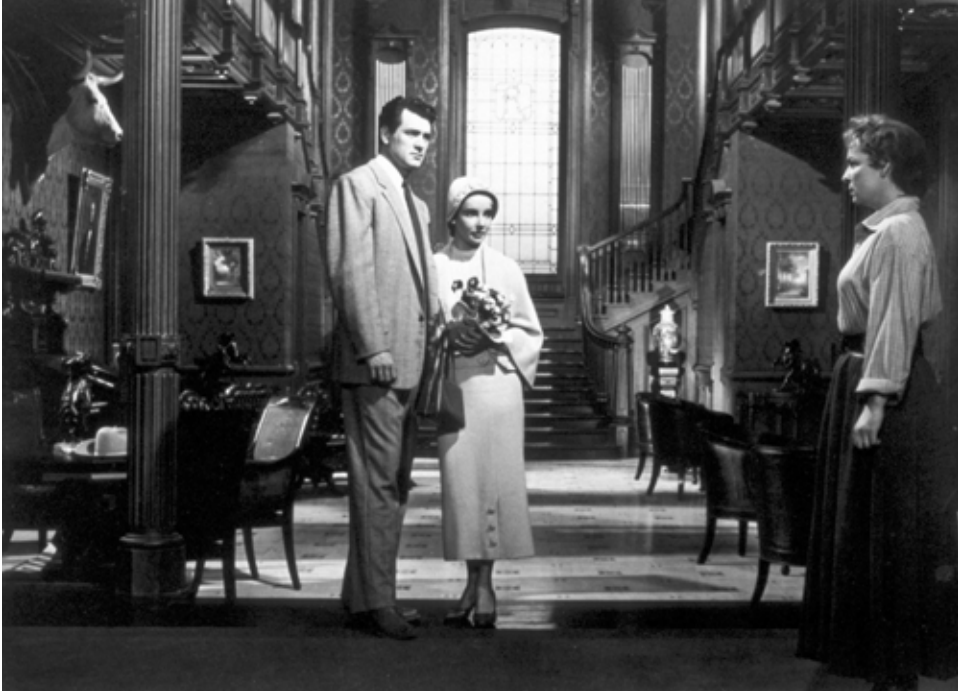
Bick (Rock Hudson) and Leslie Benedict (Elizabeth Taylor) are "welcomed" by Luz Benedict (Mercedes McCambridge).

From the moment Leslie arrives in Texas, she turns the lives of Bick and his sister, who lives with him in a large Victorian mansion, upside down. The film depicts several clashes, most of which concern Leslie's negative response to her