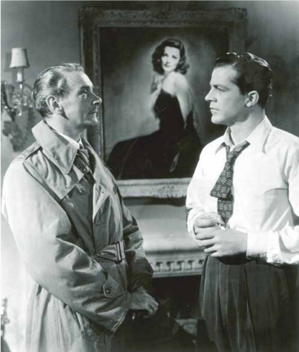
Clifton Webb and Dana Andrews standing in front of the portrait of Laura (Gene Tierney).

evoke in the audience.” Preminger agreed to this, and the main theme was composed and subsequently used at frequent intervals in the film. However, the use of the song in the film is only part of the story, as a year later, lyrics were added to the melody to create a jazz standard that would go on to be recorded over four hundred times. It is one of the most recorded pieces of music in history. Raksin was suffering with writer’s block during the weekend when he was to compose the theme and came across a letter from a girlfriend. He had not been able to