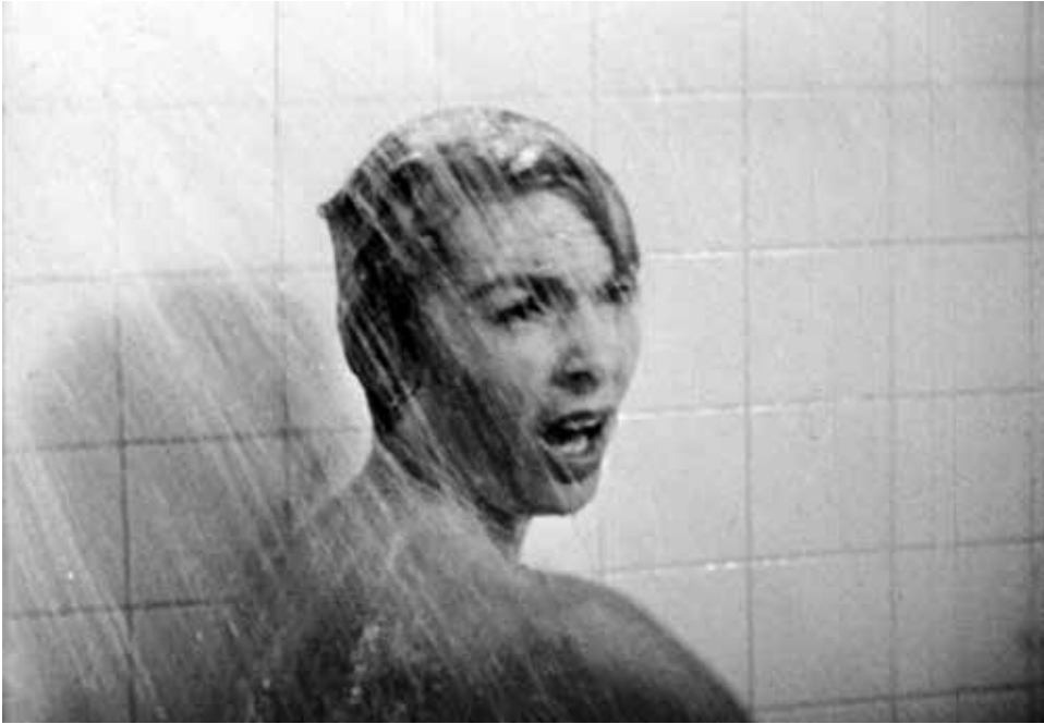
Just taking a shower: Janet Leigh as Marion Crane.

score even more astounding. Composer Fred Steiner understood Herrmann's "black-and-white score" analogy, stating, "When the expressive range of the strings orchestration is compared to that of black-and-white photography, Herrmann's analogy becomes perfectly clear. Both have the capability within the limits of one basic colour of delivering an enormous range of expression and of producing a great variety of dramatic and emotional effects."