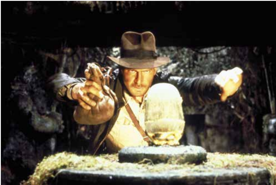
Harrison Ford as the iconic Indiana Jones in an early scene from Raiders of the Lost Ark.

The film was nominated for nine Academy Awards, winning five of them for Best Art Direction, Best Sound, Best Film Editing, Best Effects, and Sound Effects Editing (special award). It also received one Golden Globe nomination and won two of seven BAFTA nominations.