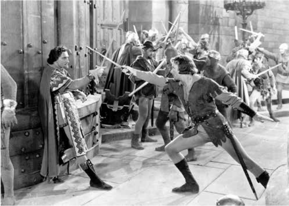
Basil Rathbone and Errol Flynn engaged in one of cinema's great swordfights.

Erich treated it like an opera." She also said that in his operas Korngold treated the orchestra and the singers as equals. He did the same with the films he scored, only with actors speaking their lines instead of singing them.