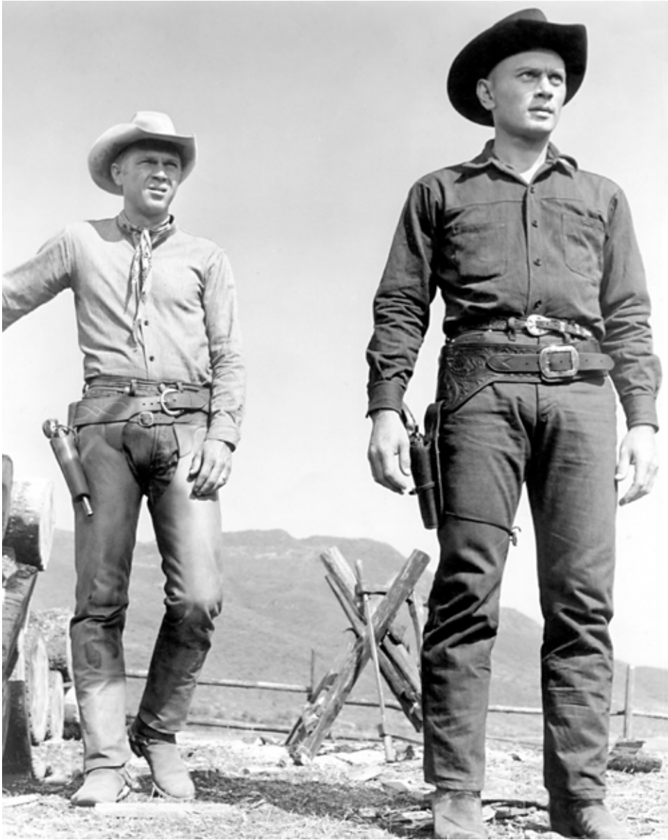
Two of the Magnificent Seven: Steve McQueen and Yul Brynner.

and Sturges has since called it one of the best film scores ever written. It was placed eighth on the American Film Institute's top twenty-five list of greatest all-time film scores.