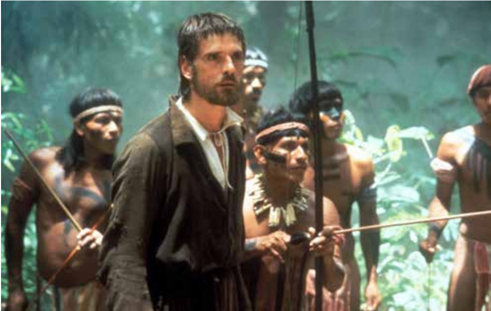
Father Gabriel (Jeremy Irons, center) among South American tribesmen.

The first music in Morricone's score features both traditional string instruments and native drums as an eerie background for a scene in which several Guarani tribe members bear a wooden cross to which a missionary priest has been tied. Once the cross is tossed into a river the music stops and the only subsequent sounds are those of the water, which becomes increasingly turbulent as the cross plunges over a waterfall.