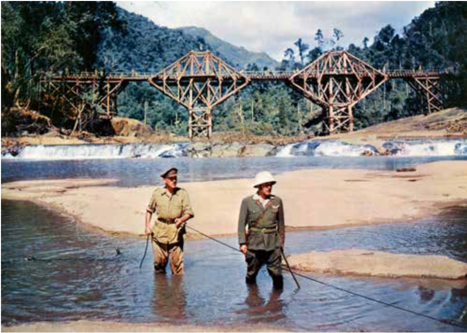
Alec Guinness (left) and Sessue Hayakawa in front of the bridge on the Kwai River.