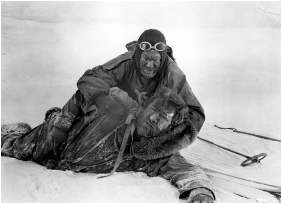
Captain R. F. Scott (John Mills, with goggles) and P. O. "Taff" Evans (James Robertson Justice).

The film documents the origin of the expedition, which begins in 1910 when Scott first attempts to raise the funds necessary for the journey. Once he and scientist Edward Wilson (Harold Warrender) procure the financial backing for the expedition, Scott approaches the other men that he needs to assist him in making the historic journey possible.