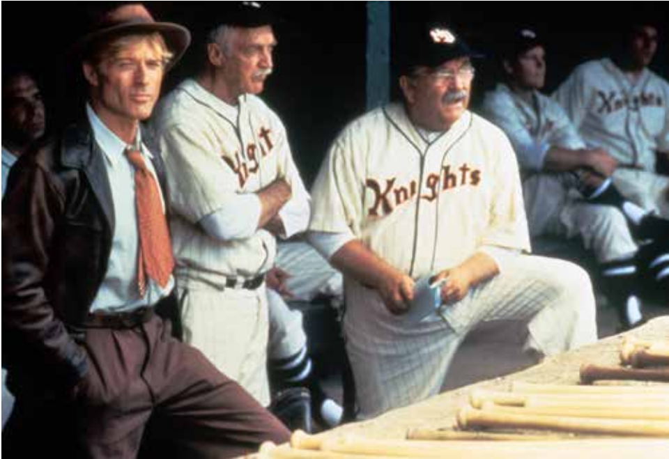
Roy Hobbs (Robert Redford, left), Red (Richard Farnsworth), and Pop Fisher (Wilford Brimley, right).

as an adult by Glenn Close). Also included is a theme for brass and strings that utilizes the pentatonic scale. This theme, which is the film's most heroic musical idea, is first heard when Roy carves a baseball bat out of wood from a tree that is struck by lightning during a thunderstorm that follows the fatal heart attack of Roy's father. As the bat is shown in close-up with the name "Wonderboy" inscribed on it, the horns are featured in a dramatic version of the heroic theme, which includes a six-tone extension with a boldly rising melodic jump.