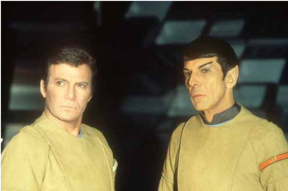
Resuming their mission: Captain James T. Kirk (William Shatner) and Mr. Spock (Leonard Nimoy).

by soaring violins and French horns accompanied by resonant brass chords and pounding timpani.