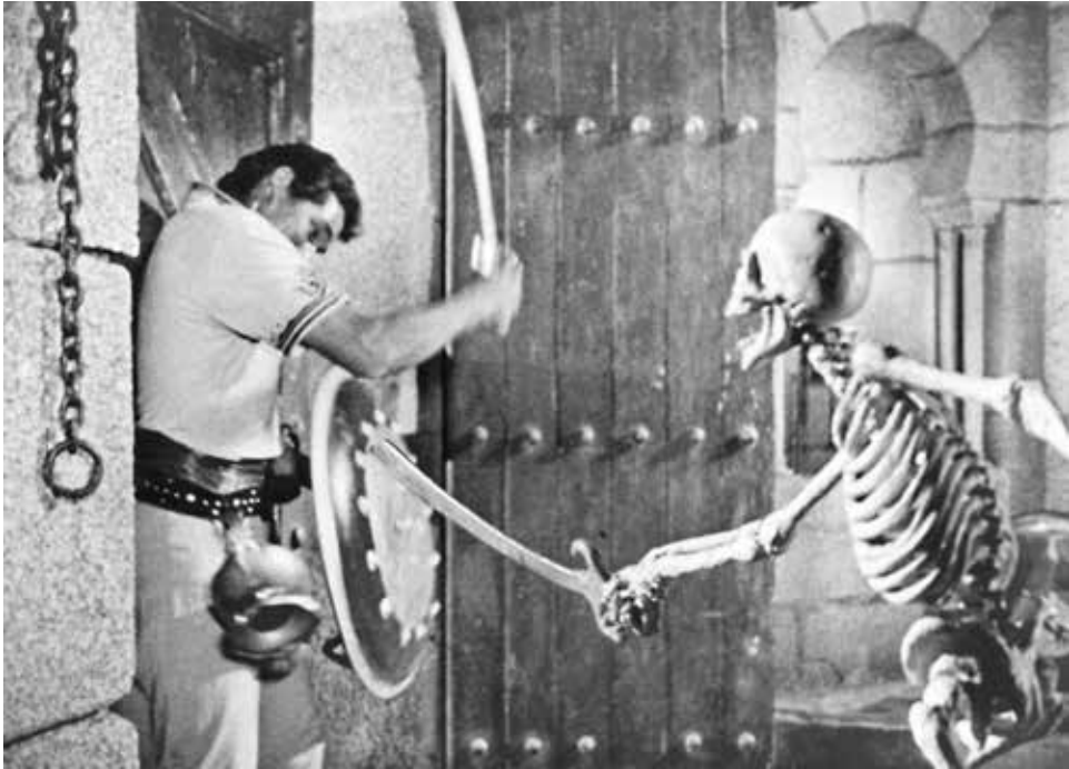
Kerwin Mathews (as Sinbad) battles a reanimated skeleton, thanks to the stop-motion magic of special effects master Ray Harryhausen.

eggshell from which is needed to restore Parisa to human size. There is also a human skeleton that Sokurah magically brings to life as a means of killing Sinbad in a climactic sword fight.