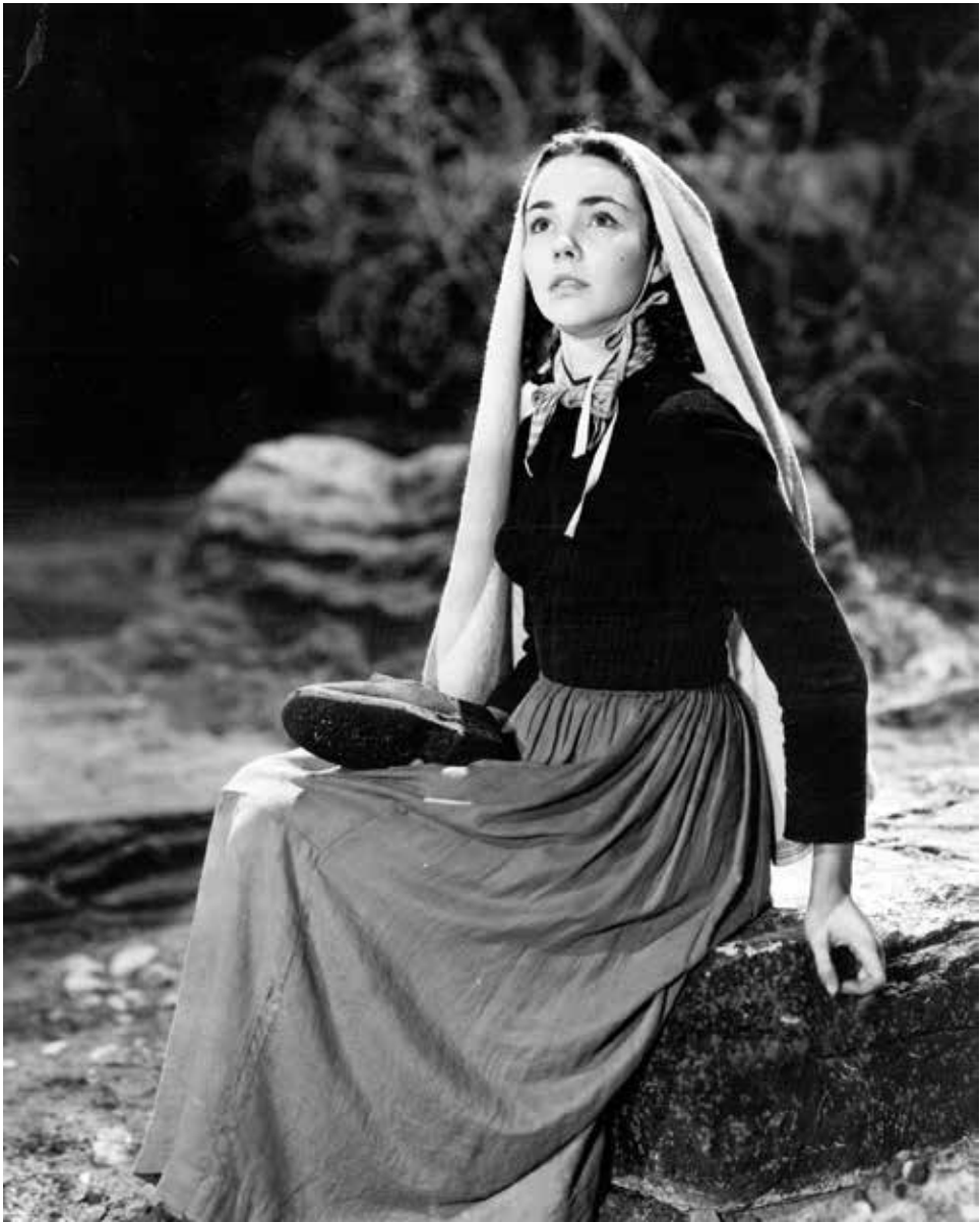
Jennifer Jones in her Academy Award–winning role of Bernadette Soubirous.