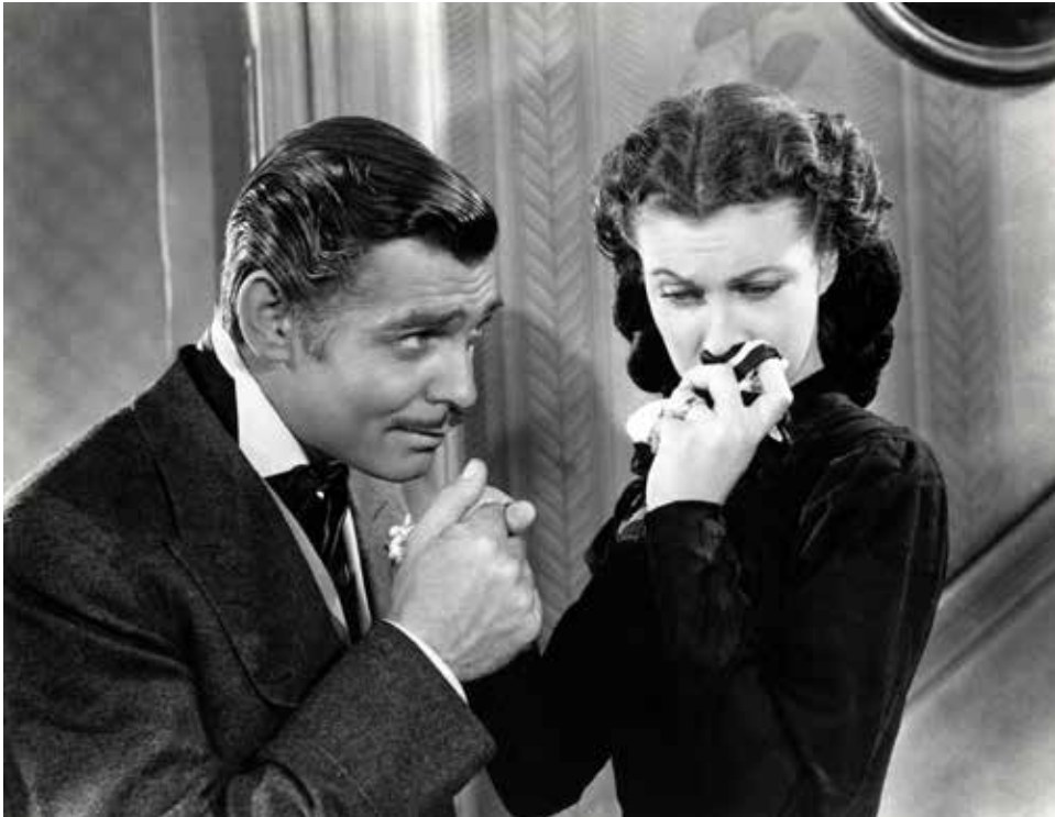
Rhett Butler (Clark Gable) and Scarlett O'Hara (Vivien Leigh).

The film, which covers a ten-year period from the start of the Civil War to the Reconstruction era, revolves around Scarlett O'Hara (Vivien Leigh), the willful eldest daughter of a prominent Southern family that lives on Tara, a cotton plantation near Atlanta. The plot centers on Scarlett's relationships with several men, including Ashley Wilkes (Leslie Howard), the son of a nearby plantation owner, and Captain Rhett Butler (Clark Gable), a dashing visitor from Charleston, South