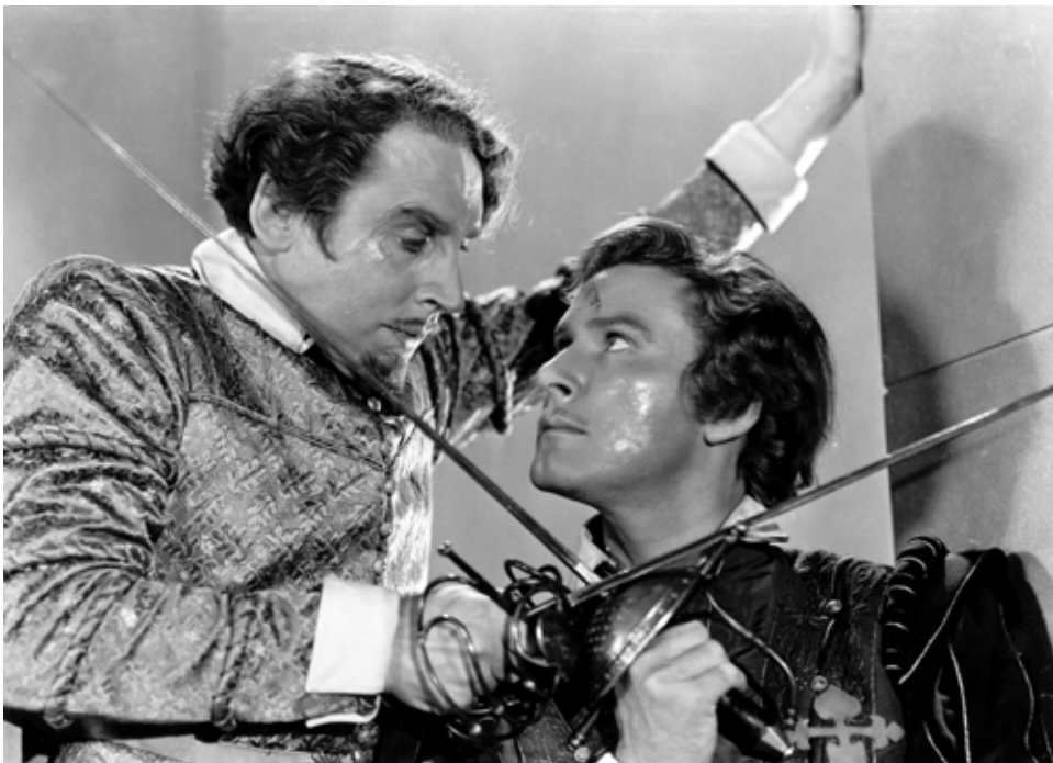
The swashbuckling Errol Flynn (right) as Geoffrey Thorpe takes on Lord Wolfingham.

The plot sees King Philip II of Spain declaring his intention to destroy England en route to world conquest. On the way to England, the ship carrying Philip’s ambassador is ambushed by the pirate ship Albatross and her captain, Geoffrey Thorpe (Flynn). Perhaps unsurprisingly, Thorpe falls in love with the ambas-