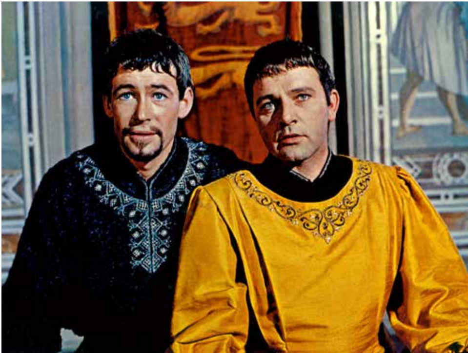
King Henry II (Peter O'Toole) and his close friend turned adversary Thomas Becket (Richard Burton).

of the relationship of Henry II (Peter O'Toole), the English monarch who reigned in the latter part of the twelfth century, and his chancellor and best friend Thomas Becket (Richard Burton). When Henry made the fateful decision to appoint Becket as the archbishop of Canterbury, his attempt to consolidate his temporal powers with those of the Catholic Church led to a series of struggles that culminated in the murder of Becket in Canterbury Cathedral. The film portrays the camaraderie of the two men in their younger years and the collapse of their friendship when Becket advises that he will serve the church first and Henry second. The latter part of the film focuses on the struggles between the two men and the events that lead up to Becket's death.