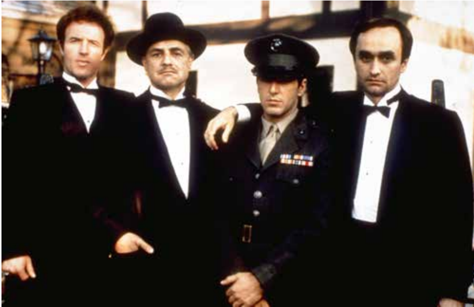
The Corleone clan: Sonny (James Caan, left), Don Vito (Marlon Brando), Michael (Al Pacino), and Fredo (John Cazale).