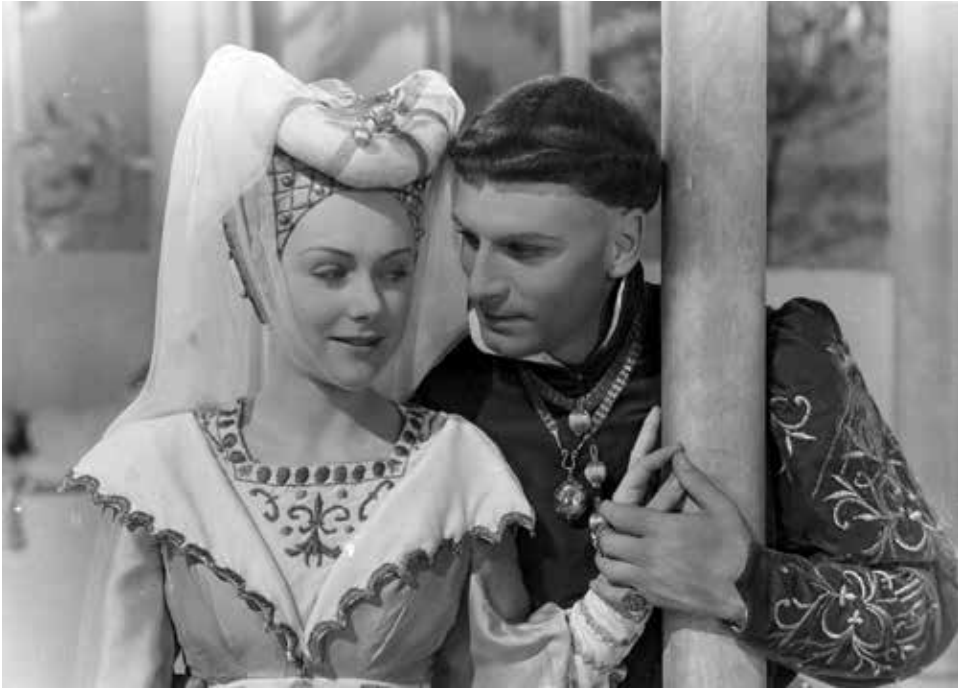
Princess Katherine (Renee Asherson) and King Henry V of England (Laurence Olivier).

are then superimposed. This music establishes the Elizabethan era of this theatrical pageant and captures the viewer's emotions right away, preparing the audience for the play that is about to begin.