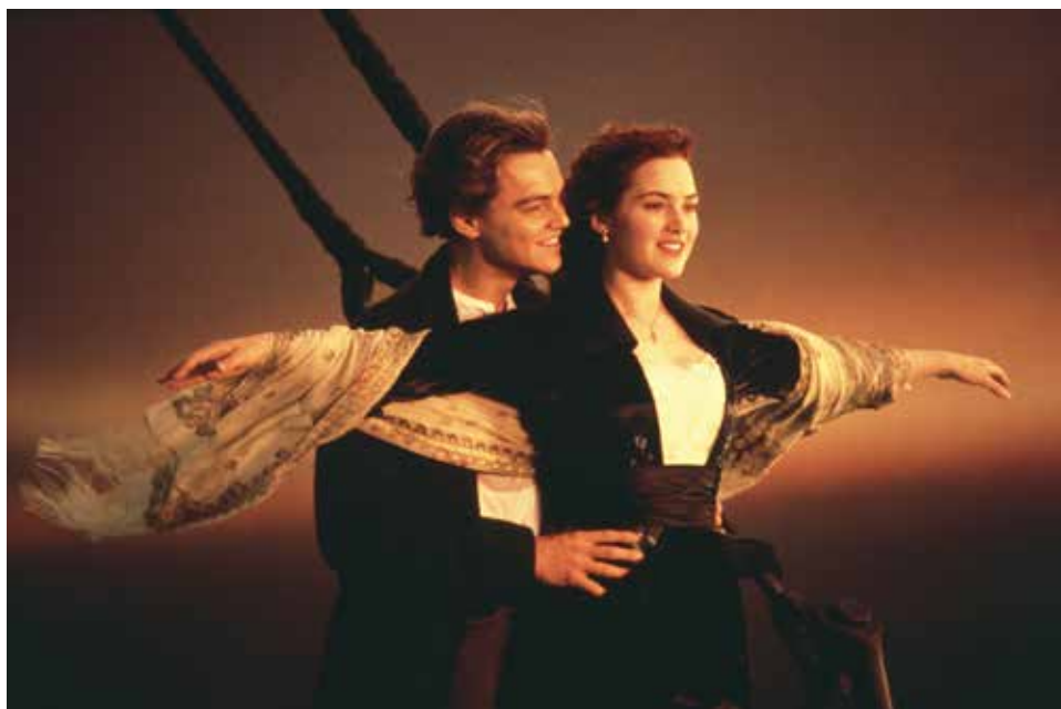
On the top of the world before falling into the icy sea: Jack Dawson (Leonardo DiCaprio) and Rose Dewitt Bukater (Kate Winslet).

The film was nominated for fourteen Academy Awards and won eleven: Best Picture, Best Director, Best Art Direction, Best Cinematography, Best Visual Ef-