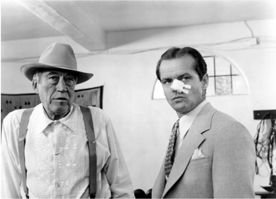
Noah Cross (John Huston) has secrets he must protect from the prying eyes of private detective J. J. Gittes (Jack Nicholson).

film in history. It also won four Golden Globes, for Best Motion Picture, Best Director, Best Actor, and Best Screenplay, as well as three BAFTAs, for Best Picture, Best Actor, and Best Screenplay.