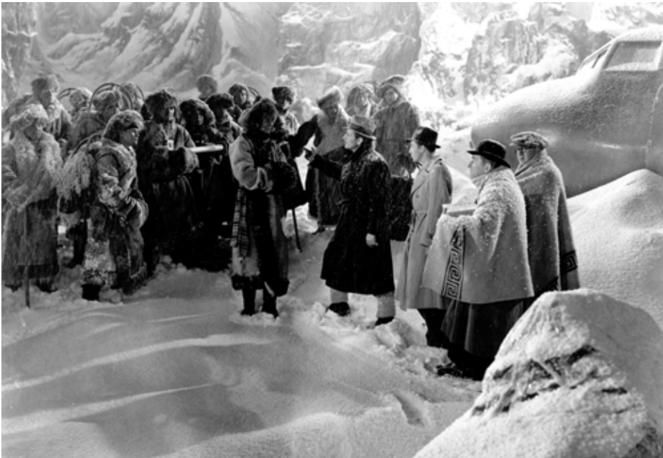
After crash-landing in the Himalayas, Robert Conway (Ronald Colman, center), George Conway (John Howard), Alexander Lovett (Edward Everett Horton), and Henry Barnard (Thomas Mitchell) are welcomed by Chang (H. B. Warner) and his people.

Hilton's story centers on Robert Conway (Ronald Colman), a British diplomat and humanitarian, who is first seen helping the evacuation of foreigners during a revolution in China. When Conway boards a plane with four other passengers, he does not realize that they are being hijacked. When the plane crashes on a mountainside, all but the pilot survive unharmed. They are soon aided by a rescue team led by the mysterious Chang. After a perilous mountain journey they arrive