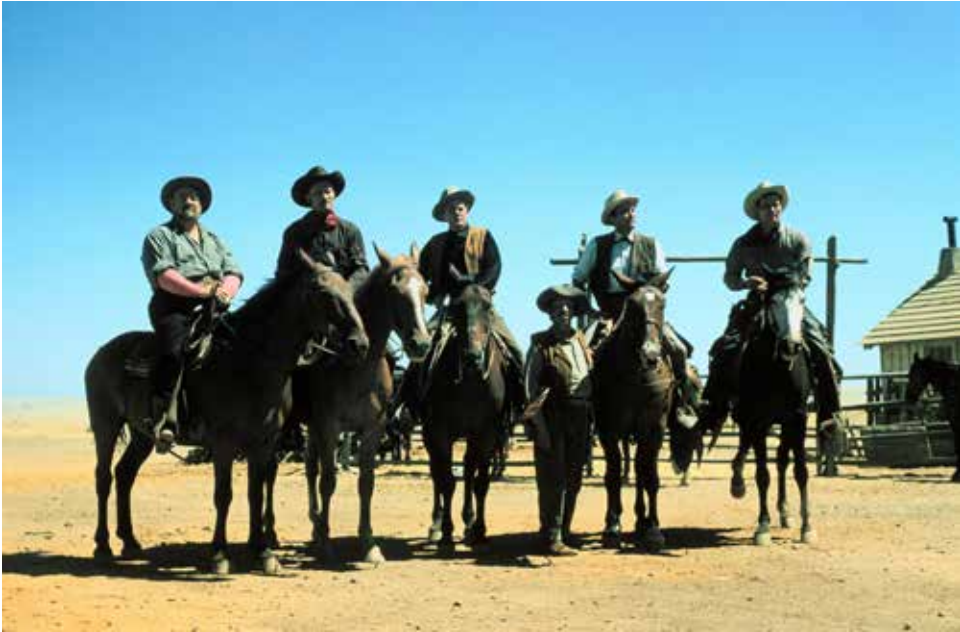
Burl Ives, Chuck Connors, Charles Bickford, Alfonso Bedoya, Gregory Peck, and Charlton Heston in the sweeping epic The Big Country .

Since the story is set in the American West, Moross attempted to achieve a sense of grandeur through the repeated use of mostly pentatonic-scale melodic ideas above basic chordal patterns.