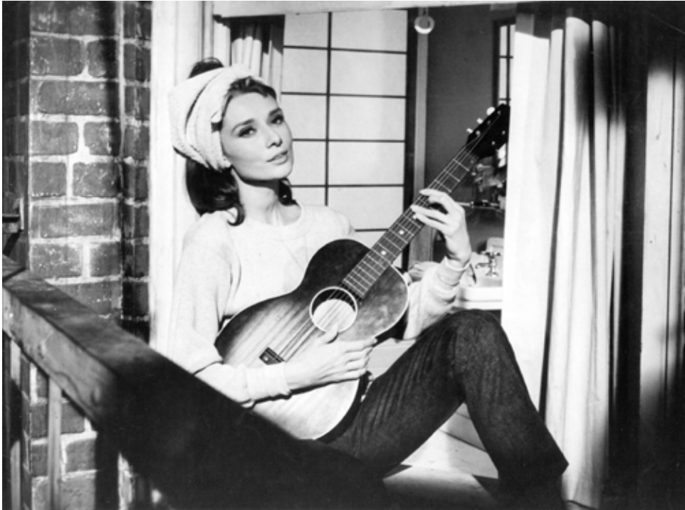
Audrey Hepburn singing the Academy Award winning song "Moon River."

Paul soon learns that Holly's real name is Lulamae Barnes and that she was married to a widowered veterinarian named Doc Golightly (Buddy Ebsen), who has come from Texas to bring her back home. She reminds Doc that their marriage has been annulled and that she is not Lulamae anymore.