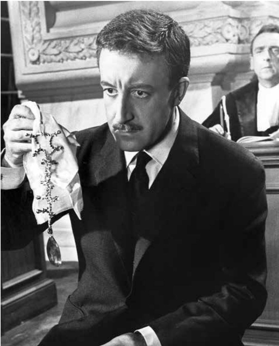
Peter Sellers in his iconic role of Inspector Jacques Clouseau.