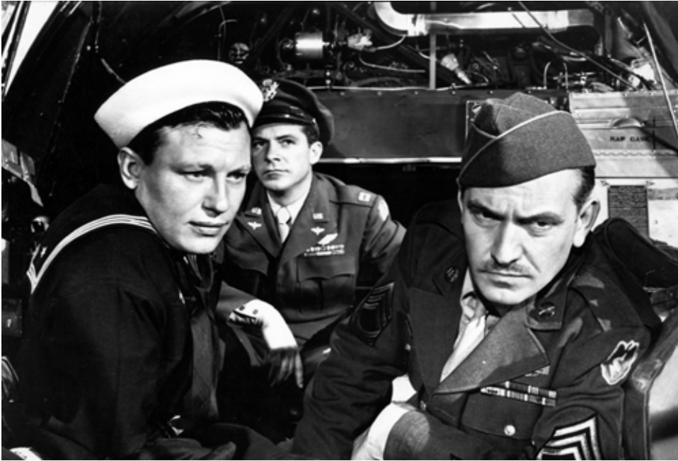
From left: Harold Russell, Dana Andrews, and Fredric March as WWII veterans who face obstacles returning to civilian life.

the Army Air Corps. Meanwhile, Homer Parrish (Harold Russell), a navy ensign from a typical working-class neighborhood, was badly burned in a Japanese attack on his ship. Homer is engaged to his childhood sweetheart, Wilma (Cathy O'Donnell), but he resists her affections because he doesn't want to be pitied for the hooks he wears for hands.