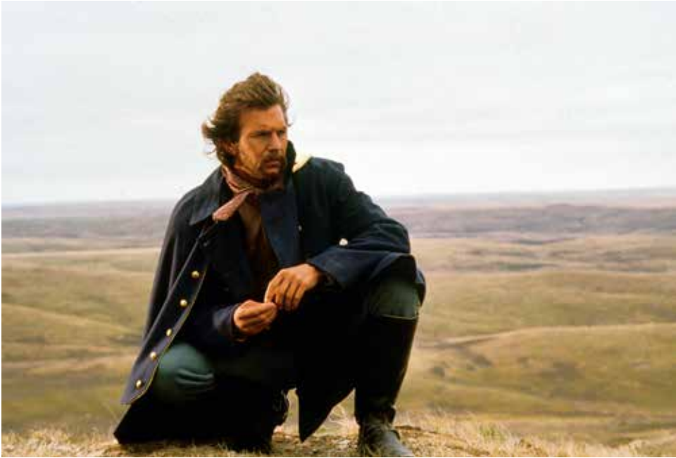
Lieutenant Dunbar (Kevin Costner).

melody begins with a five-tone motif that utilizes the pitches of a bugle call. This theme is also prominently featured in a scene where Dunbar, in full military uniform and carrying the US flag, rides his horse Cisco to meet the Lakota at their campsite.