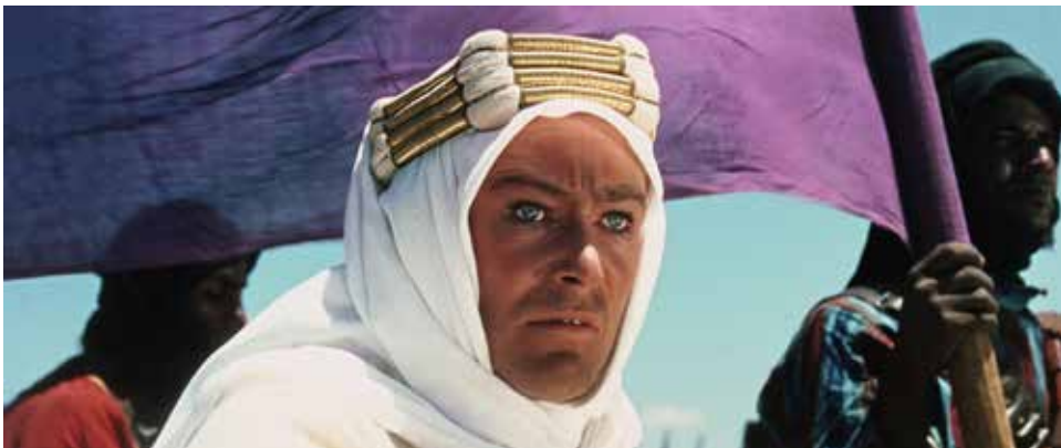
Peter O'Toole as T. E. Lawrence.

The score to Lawrence of Arabia was composed by Maurice Jarre, a French composer who is rightly considered "one of the giants of twentieth-century film music" and was known for writing in a variety of styles, from sweeping orchestral themes to