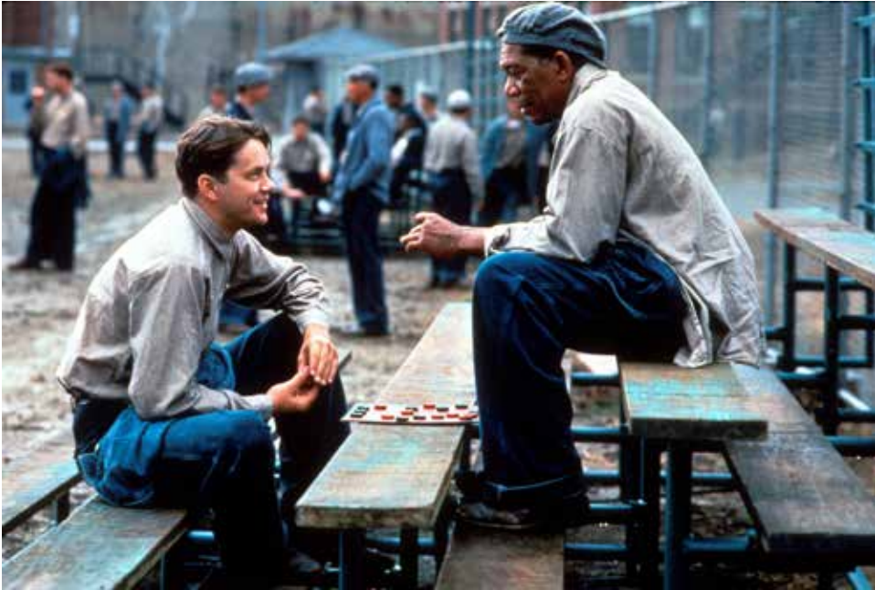
Andy Dufresne (Tim Robbins) and Ellis Boyd “Red” Redding (Morgan Freeman) enjoy a game of checkers in the prison yard.

The film was nominated for seven Academy Awards and two Golden Globes, but has no major award victories to its name.