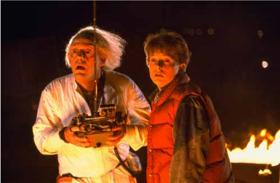
Christopher Lloyd and Michael J. Fox preparing to travel back in time.

majestic march-like theme. Both make extensive use of brass, such as trumpets and French horns, and crashing percussion. The strings interject with flourishes and connecting melodic passages. Neither the fanfare nor march is heard in its entirety during the film itself, but the audience instead hears fragments that advance the narrative at crucial moments. It is worth mentioning at this juncture that the film does not open with music. The opening five minutes contain only the sound of ticking clocks, before Marty almost blows himself up by plugging his electric guitar into an extremely large amplifier. The first music we hear in the film is “The Power of Love” by Huey Lewis and the News.