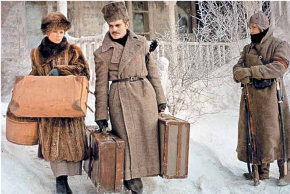
Lara (Julie Christie) and Yuri Zhivago (Omar Sharif).

In the film, Yuri is first seen as a young boy attending his dead mother's burial. He is thereafter raised in Moscow by Alexander Gromeko and his wife, an affluent couple who were good friends of his mother. He also befriends the Gromekos' daughter, Tonya (played as an adult by Geraldine Chaplin). As he grows into manhood, Yuri (now played by Omar Sharif) writes poetry and begins his medical studies. He also becomes an attentive observer of the growing unrest among the working class. When World War I begins, Yuri is married to Tonya and is employed as an army physician; he also meets Lara (Julie Christie), who has become a nurse in hopes of finding her husband, Pasha (Tom Courtenay), a political activist who has disappeared. Their lives are all significantly altered when the Bolshevik Revolution begins.