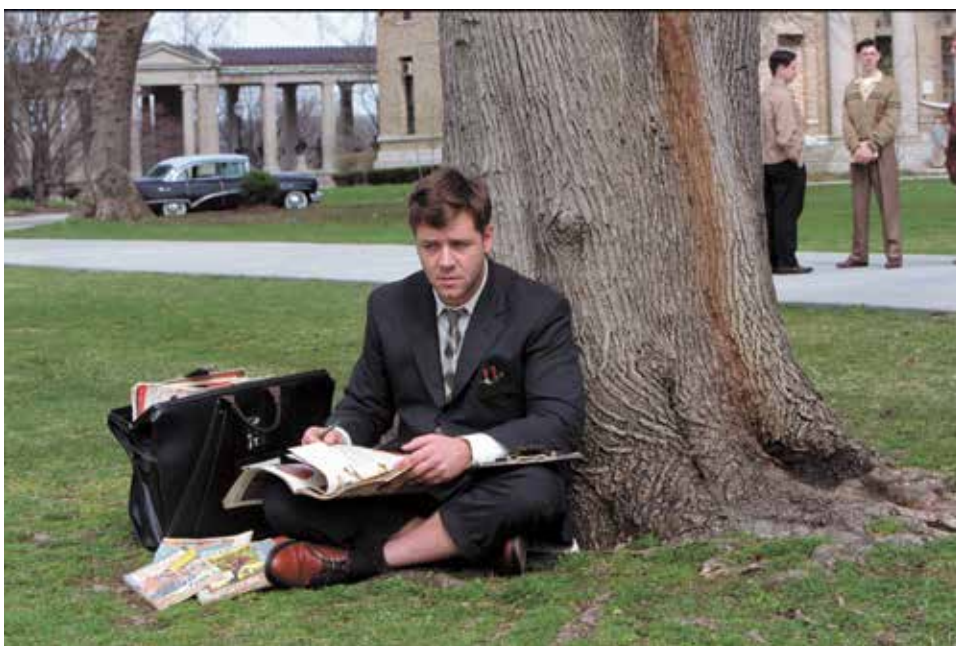
Russell Crowe as brilliant but troubled mathematician John Nash.

untimely death in a light aircraft accident in 2015. Horner wanted a haunting female voice to feature on his score, and he strove for something “reminiscent of being midway between a girl and woman.” He chose to bring fifteen-year-old Welsh singer Charlotte Church on board for the film, and the artist later said the music for the film was among the “most haunting and beautiful I have ever performed.” The notion of a kaleidoscope was adopted by Horner to represent the beauty and complexity of mathematics. In the opening theme, titled “A Kaleidoscope of Mathematics” on the recording, a wordless vocal line performed by Church is underscored with constantly evolving harmonies in orchestral ostinatos. The piano later takes over as the dominant accompanying instrument, and this, along with Church’s haunting vocals, gives the score a humanized, poignant feel that represents the tragic genius of Nash’s character.