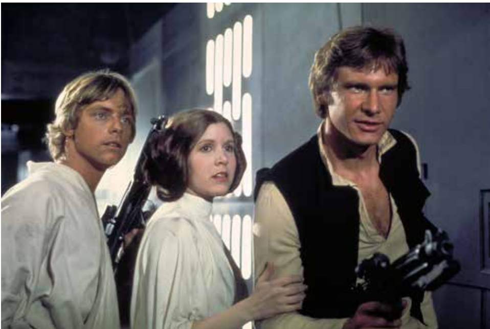
Mark Hamill, Carrie Fisher, and Harrison Ford before they became cinematic icons.

Starring Mark Hamill, Carrie Fisher, and Harrison Ford, Star Wars is set "a long time ago in a galaxy far, far away," to quote the now-famous opening captions that precede each film. In the original 1977 film, later titled "Episode IV: A New Hope," the Empire, under the rule of antagonist Darth Vader, holds Princess Leia (Fisher) as prisoner, in an effort to crush the rebellion being fought against it. Luke Skywalker (Hamill) and Han Solo (Ford) work together to rescue the princess, assist the Rebel Alliance, and restore freedom and justice to the galaxy by attempting to defeat the Empire. The film was referred to as Episode IV because it was always Lucas's intention to create a prequel trilogy, which eventually arrived be-