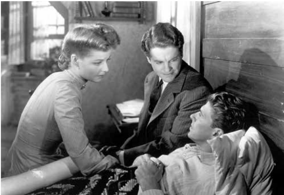
Randy Monaghan (Ann Sheridan) and Parris Mitchell (Robert Cummings) console an ailing Drake McHugh (Ronald Reagan).

Bellamann's novel, which is set in the fictional midwestern town of Kings Row, spans a period from the late 1880s into the early 1900s. Despite the sign at the edge of town that describes Kings Row as "A Good Clean Town," there is a lot about the town that isn't very wholesome. Parris Mitchell (played as an adult by Robert Cummings) is raised by his grandmother (Maria Ouspenskaya), who lovingly ensures his educational progress as a medical student as well as his advancement as a pianist. Parris has long had a liking for Cassie Tower (Betty Field), the daughter of Dr. Tower (Claude Rains), whose mentally troubled wife is a virtual prisoner in the family home. While being tutored by Dr. Tower, Parris falls in love