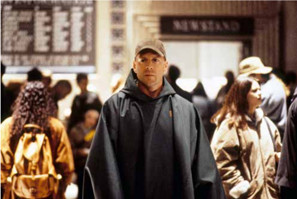
Bruce Willis as the nearly indestructible David Dunn.

The film's first music occurs in the opening scene, set in 1961, when a black woman gives birth in a Philadelphia department store. As a doctor examines the newborn Elijah and finds the infant's limbs are broken, a soft theme played by piano and strings enters. This idea, primarily based on a descending motif of seven pitches, is soon joined by syncopated drum sounds provided by a synthesizer. This music, the "seeking" motif, leads directly into the film's credits.