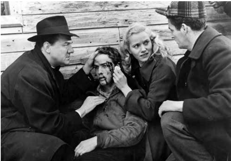
Father Barry (Karl Malden, left) tends to the badly beaten Terry Malloy (Marlon Brando), with his distressed girlfriend, Edie (Eva Marie Saint), at his side.

Screenwriter Budd Schulberg based his script on a 1949 Pulitzer-Prize-winning series of articles by New York Sun reporter Malcolm Johnson that exposed corruption in a longshoremen's union that represented New York-area dockworkers. In the film, which takes place on the New Jersey side of the East River, Marlon Brando plays Terry Malloy, an ex-boxer who works on the docks. His life is complicated by his brother Charley's involvement with the local union and its ruthless boss, Johnny Friendly (Lee J. Cobb). Unknowingly, Terry sets up the killing of a dockworker who was about to testify to federal investigators about corrupt labor practices by union leaders. His life gets even more