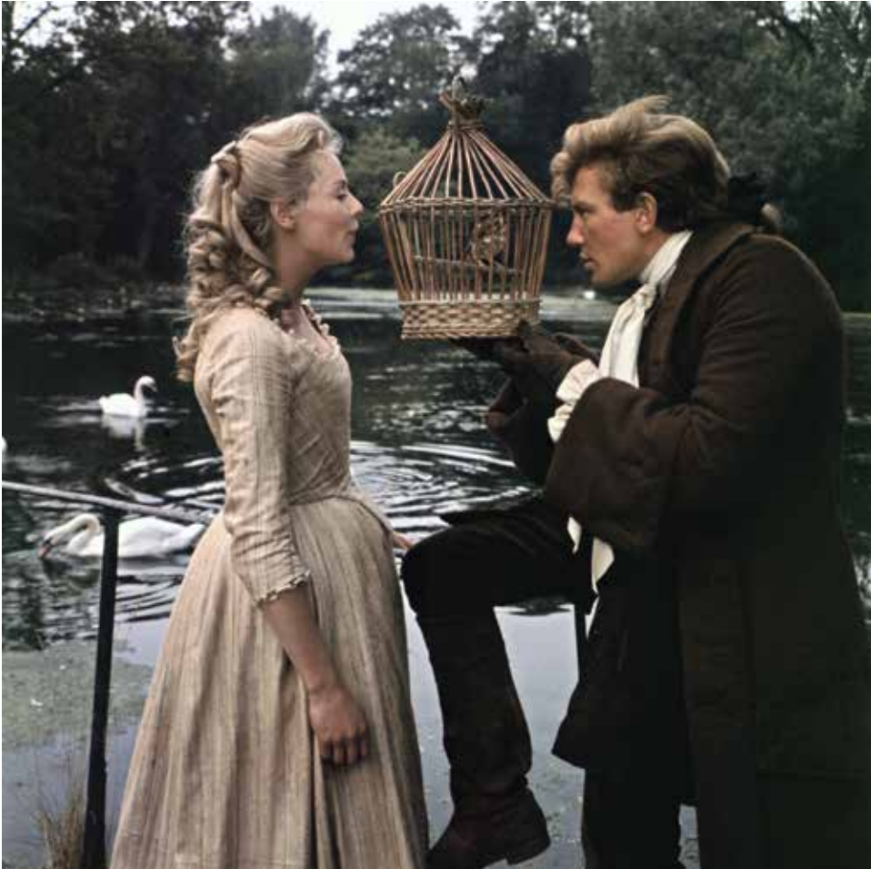
Sophie Western (Susannah York) and the hedonist Tom Jones (Albert Finney)