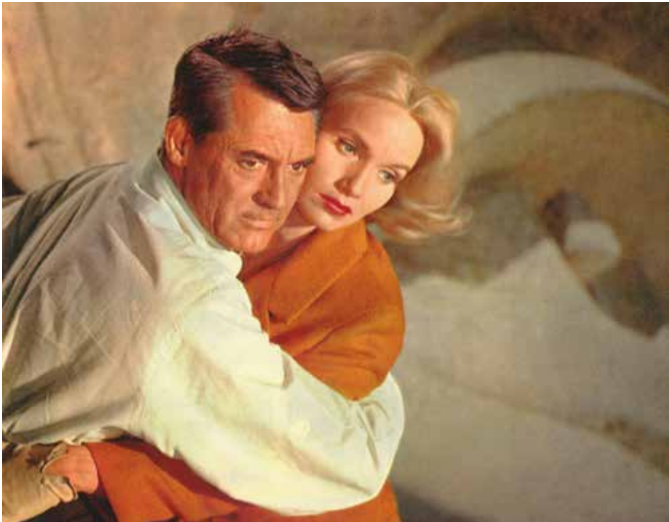
Roger O. Thornhill (Cary Grant) and Eve Kendall (Eva Marie Saint) are pursued on Mount Rushmore.

North by Northwest is widely regarded as one of the finest films ever produced. It is one of seven Hitchcock films to feature the music of Bernard Herrmann. Unusually for the period, it also features kinetic typography (or moving text) in the opening credits, designed by graphic designer Saul Bass. Some have called it the first James Bond film, with the suspense, action, and thrills of Hitchcock's film easily comparable to the Bond films that would begin to appear three years later. Starring Cary Grant as Roger Thornhill, the victim of mistaken identity, the film takes the audience on an exhilarating journey across the northern United States from New York to Chicago, before culminating in a memorable finale atop Mount Rushmore. The film was nominated for three Academy Awards, for Best Film Editing, Best Art Direction—Set Decoration (Color), and Best Original Screenplay