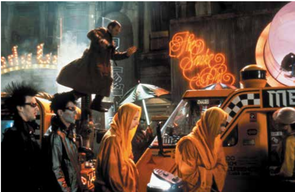
Rick Deckard (Harrison Ford), a blade runner, in 2019 Los Angeles.

Directed by Ridley Scott and inspiring a 2017 sequel, Blade Runner is a science fiction cult classic. Depicting a futuristic (2019), grungy Los Angeles, the aesthetic of the film, caught between science fiction and film noir, resulted in critical acclaim and an enduring appeal to film fans across the globe. It should be noted, however, that success was a slow burner. Initial reactions were mixed, and it only returned $33 million at the box office, a profit of just $5 million. Despite the uncertainty among critics on release, the film was nominated for eight BAFTAs, two Academy Awards, and a Golden Globe. Of these, the film won Best Cinematography, Best