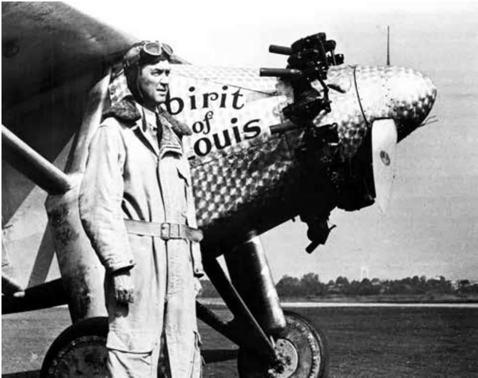
James Stewart as aviation hero Charles Lindbergh.

in the airplane and using his map to calculate his progress while fending off the desire for sleep after being awake for a full day before his takeoff.