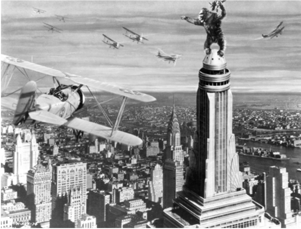
Atop the Empire State Building, King Kong is attacked by machine gun-bearing planes.

three tones, in a waltz rhythm, represents Ann. The third idea is a rapid-paced four-note idea that underscores several action scenes in the film.