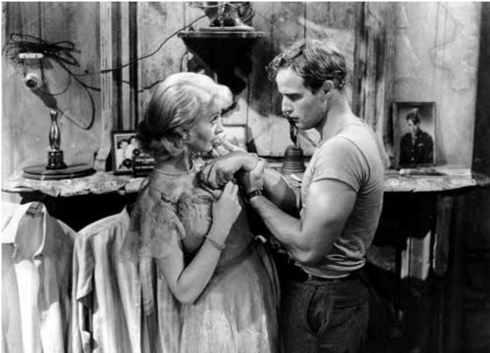
Mentally frail Blanche DuBois (Vivien Leigh) is manhandled by her brother-in-law Stanley Kowalski (Marlon Brando).

The film was overwhelmingly successful and received twelve Academy Award nominations, of which it won four for acting. It was also nominated for three Golden Globes, winning one, and two BAFTAs, winning one. In terms of Academy Award nominations, it is the joint third-most-successful film of all time.