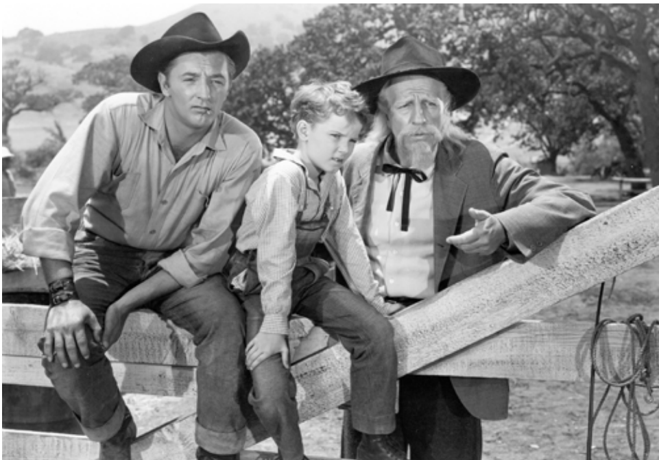
From left: Billy Buck (Robert Mitchum), Tom Tiflin (Peter Miles), and Tom's grandfather (Louis Calhern).

The plot of the film, which John Steinbeck adapted from his own short novel, takes place on a California ranch in the early twentieth century, where young Tommy (Peter Miles) has been promised a colt when the family's mare, Rosie, gives birth. His parents, Alice and Fred Tiflin (Myrna Loy and Shepherd Strudwick) try to raise him to be a rancher, but Tommy is a daydreamer who can imagine himself as a knight in shining armor or a circus performer. Ranch foreman Billy Buck (Robert Mitchum) encourages Tommy's sense of adventure when he shows the boy newspaper accounts of his rodeo exploits. Tommy soon learns that raising a horse is much more difficult than he could have imagined.