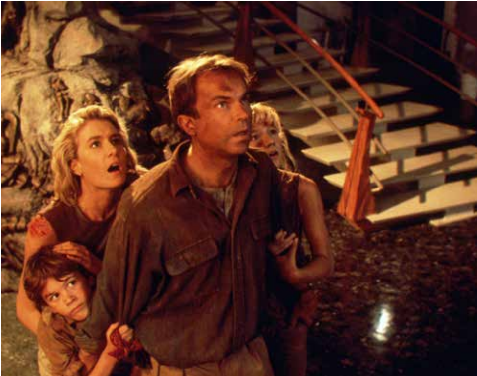
Tim (Joseph Mazzello), Ellie (Laura Dern), Grant (Sam Neill), and Lex (Ariana Richards) face a fearsome T-Rex.

Directed by Steven Spielberg and starring Sam Neill, Jeff Goldblum, and Richard Attenborough, Jurassic Park brought dinosaurs to the big screen as never before. Based on a novel by Michael Crichton, the film had a budget of $63 million and eclipsed this by taking in over $1 billion at the box office. Adjusted for inflation, it is in the top twenty-five films of all time by box-office returns, both domestically and globally. One of its later sequels, Jurassic World (2015), performed even better; it sits in fourth place in both rankings.