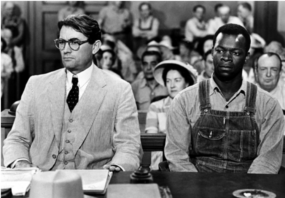
Defense lawyer Atticus Finch (Gregory Peck) and his client Tom Robinson (Brock Peters).

brother, Jem, during the Great Depression. Scout's narration also includes her father's legal defense of Tom Robinson, a black man, who is accused of raping a white woman. The children, along with Dill, a neighbor's nephew, become witnesses to the story's major events, including Robinson's trial and their father's attempts to see that justice is carried out. During this time, Atticus fears for the safety of his children and ultimately learns that their well-being depends on a most unlikely hero.