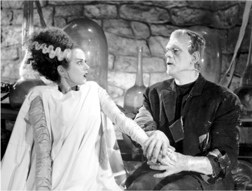
Elsa Lanchester as the bride and Boris Karloff as Frankenstein's monster.

The first melodic idea in the score is the Monster motif, a five-note idea in which three short tones of the same pitch lead to a higher long-held tone and then a repeat of the first tone.