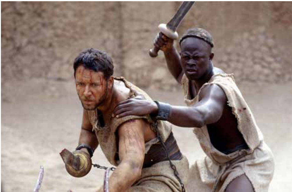
Maximus (Russell Crowe) and Juba (Djimon Hounsou) in the Colosseum.

The film was responsible for an upsurge in interest in the Roman period, and aside from the occasional anachronism or fictional character, it is regarded as a faithful adaptation of life in the historical period it depicts.