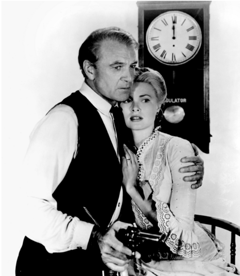
Marshal Will Kane (Gary Cooper) and his young bride Amy (Grace Kelly).

return to the first pitch. In creating this section Tiomkin used the b motif six times. The song then concludes with a repeat of the a idea.