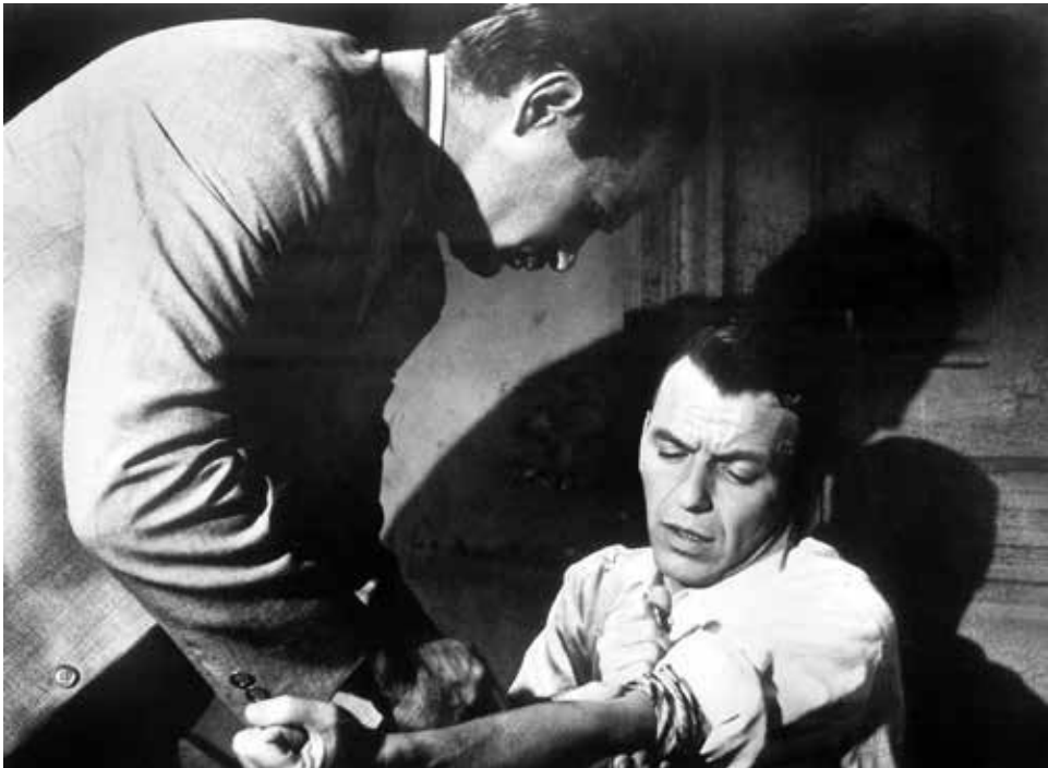
Louie (Darren McGavin) watches as the heroin-addicted Frankie (Frank Sinatra) prepares to shoot up.