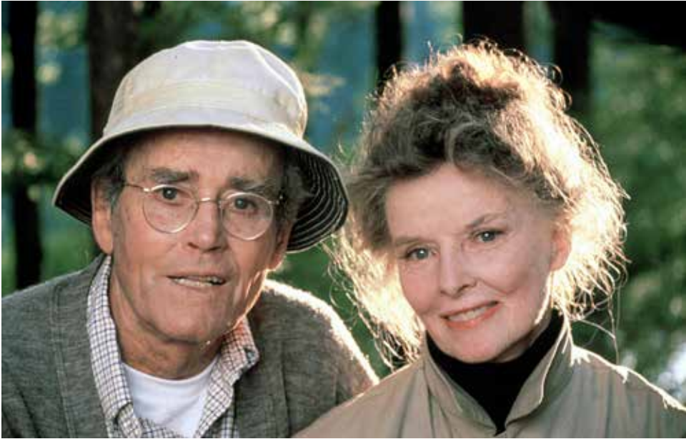
In their twilight: Norman Thayer Jr. (Henry Fonda) and Ethel Thayer (Katharine Hepburn).