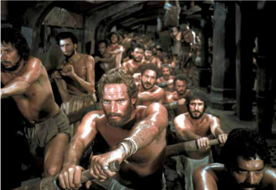
Charlton Heston as slave Judah Ben-Hur.

The biblical connection in Ben-Hur stems from Wallace's idea that Judah's life has links to that of Jesus of Nazareth. Both are about the same age, and their lives converge on two fateful occasions. Wallace's story also involves Judah's relationship with his childhood friend, Messala (Stephen Boyd), whose ambition as a Roman soldier is fueled by his military training in Rome. It is Messala who arrests Judah and has him condemned to slavery. After regaining his freedom, revenge spurs Judah to oppose his former friend in a spectacular chariot race.