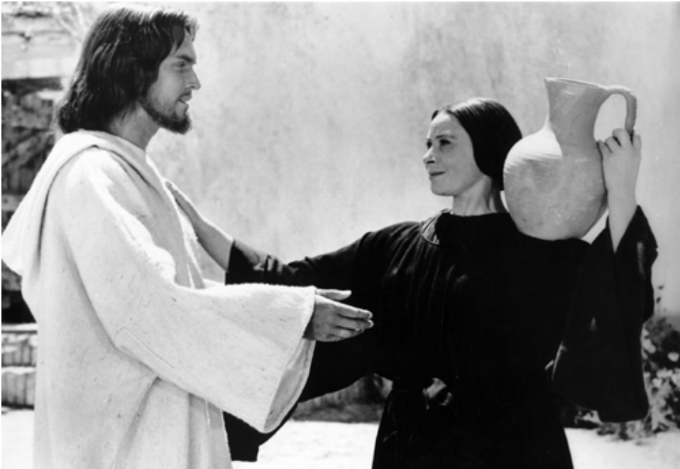
A reverent depiction of Jesus (Jeffrey Hunter) and Mary (Siobhan McKenna).