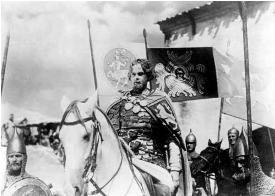
Nikolai Cherkasov as Alexander Nevsky.

Eisenstein's film, which is set in the thirteenth century, documents the heroics of Prince Alexander, who earned the nickname Nevsky after leading a Russian army in a decisive battle against the invading Swedish army that took place on the river Neva in 1240. This victory led to Alexander's unification of Russian duchies to defeat an army of German knights on the river Chudskoye in 1242. The film culminates with his victorious entry into Pskov, where he is celebrated as a national hero.