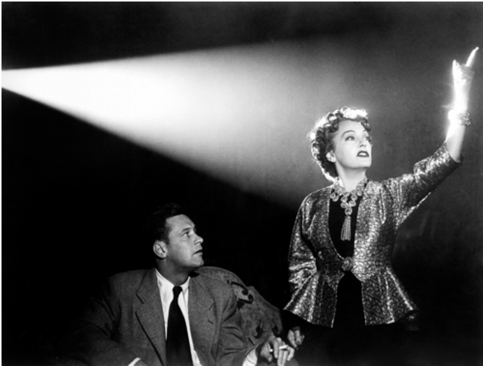
Screenwriter Joe Gillis (William Holden) and faded star Norma Desmond (Gloria Swanson).

of his style. He wrote with a rich German Romanticism, inspired by greats such as Richard Strauss, Richard Wagner, and Erich Wolfgang Korngold. His music was described as “elegant and full,” but also “slightly tortured,” and he was praised for enhancing the dark psychology and emotional tension in his previous scores. Waxman utilized his belief in orchestral color in this score. He claimed that melody was secondary to him and that he would instead see a scene and “hear” a particular ensemble of instruments, not necessarily a melodic line.