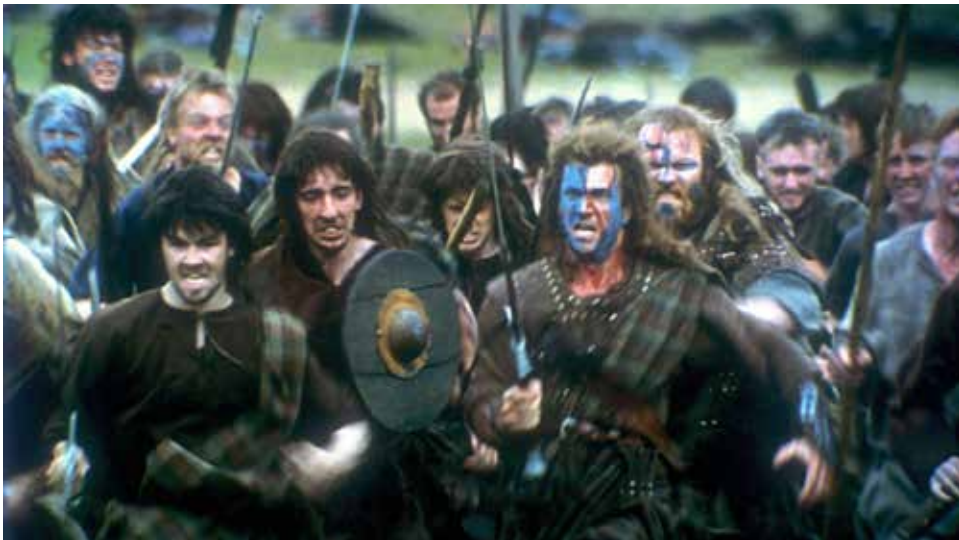
William Wallace (Mel Gibson) leads a charge.

A young William Wallace, whose father and brother have been killed fighting the English, returns to his homeland and finds his childhood sweetheart Murron (Catherine McCormack), and the two quickly fall in love. They hear rumors of a revolt against the English, but Wallace is uninterested, wanting only to live in peace. However, when Murron is killed by English soldiers the day after their secret marriage, Wallace single-handedly defeats the whole platoon. The other villagers join him by razing the garrison, and so begins the revolt against the English in what soon turns into an all-out war. Wallace leads his fellow Scots in a series of battles that dent English domination, and he has an illicit affair with the Princess of Wales (Sophie Marceau). He is eventually executed in London, but not before spectacularly shouting "FREEDOM!" in one of the film's most heartbreaking and memorable moments.