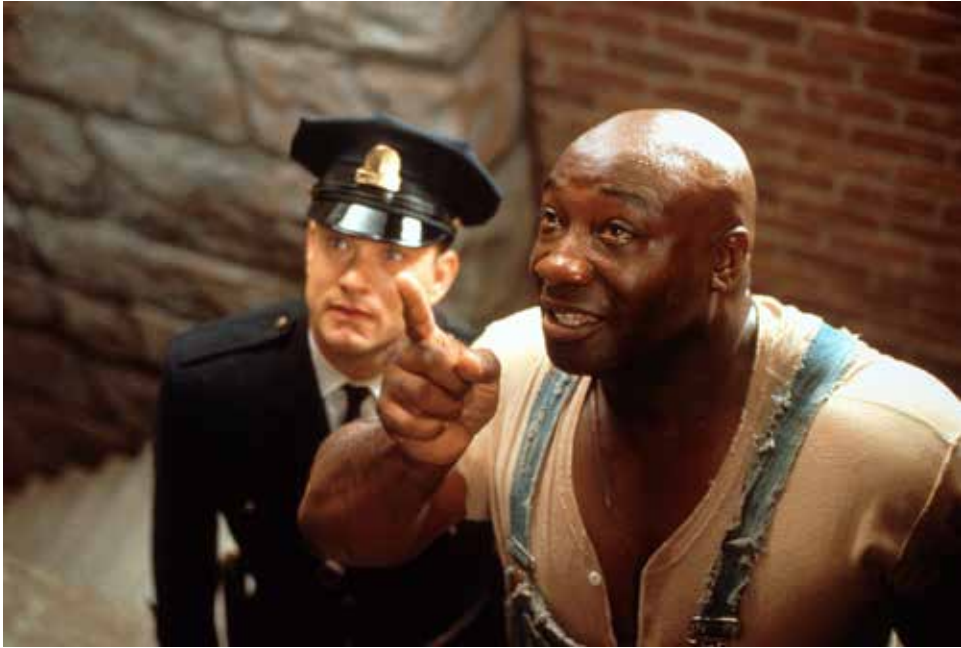
Death row guard Paul Edgecomb (Tom Hanks) and inmate John Coffey (Michael Clarke Duncan).

strings do swell, and the orchestra does rise in volume, but this soon withdraws into a smooth, relaxed string accompaniment, with the piano performing the solo arpeggiated melodic line. It is to Newman's credit that he decided against melodramatic excess. The nature of the film, and of Coffey being perceived as a physically imposing gentle giant, seems to call for a more introverted musical score.