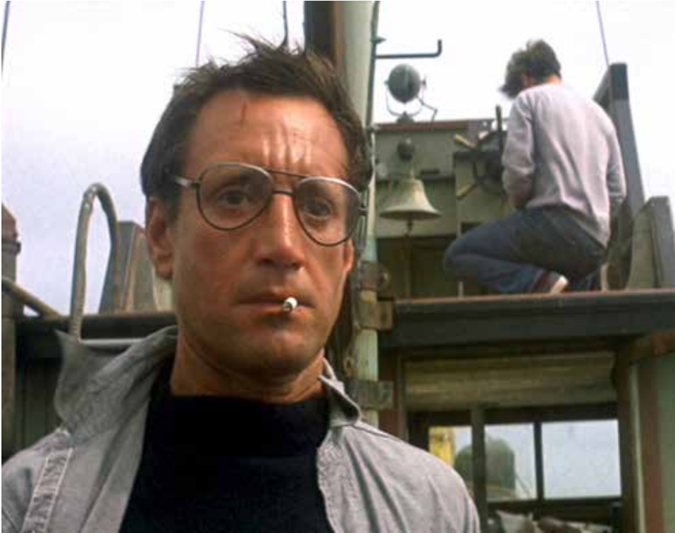
Roy Scheider as Police Chief Brody: "We're going to need a bigger boat."

There is much more to Williams's music, but the two-note motif dominates much of the film's score as a musical reminder that the shark is nearby. This suggestiveness is essential, since there is a minimum of actual shark footage. The horn motif, which conveys the heroism of the three hunters, also has considerable impact, especially in the scene where Hooper goes underwater to inspect the wreckage of a local fisherman's boat.