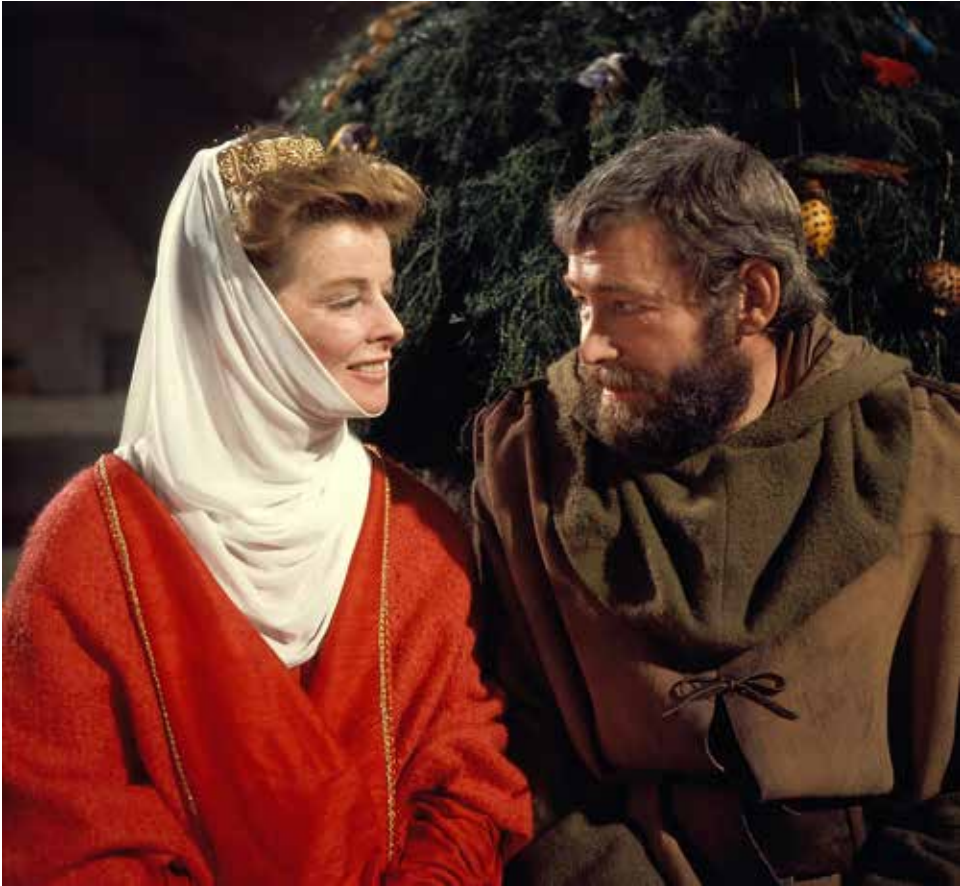
Eleanor of Aquitaine (Katharine Hepburn) and her husband, Henry II (Peter O'Toole).

A good example of this duality comes immediately in the film's opening credits, which begin musically with a loud pair of statements by trumpets and strings of a dramatic eight-note idea. The French horns and strings then repeat this idea twice. This repetitive music leads directly into a dynamic thematic statement by trumpets based on the opening idea, with rhythmic accents played by brass and strings along with repeated tones on timpani that provide a rock-music type of background. Then a melody sung by a choir is sounded above the timpani. The translation of the Latin text deals with a day of wrath and judgment, as though the music were intended for a medieval funeral mass. There is no funeral in the film, however; instead, there are numerous heated verbal exchanges concerning the royal succession.