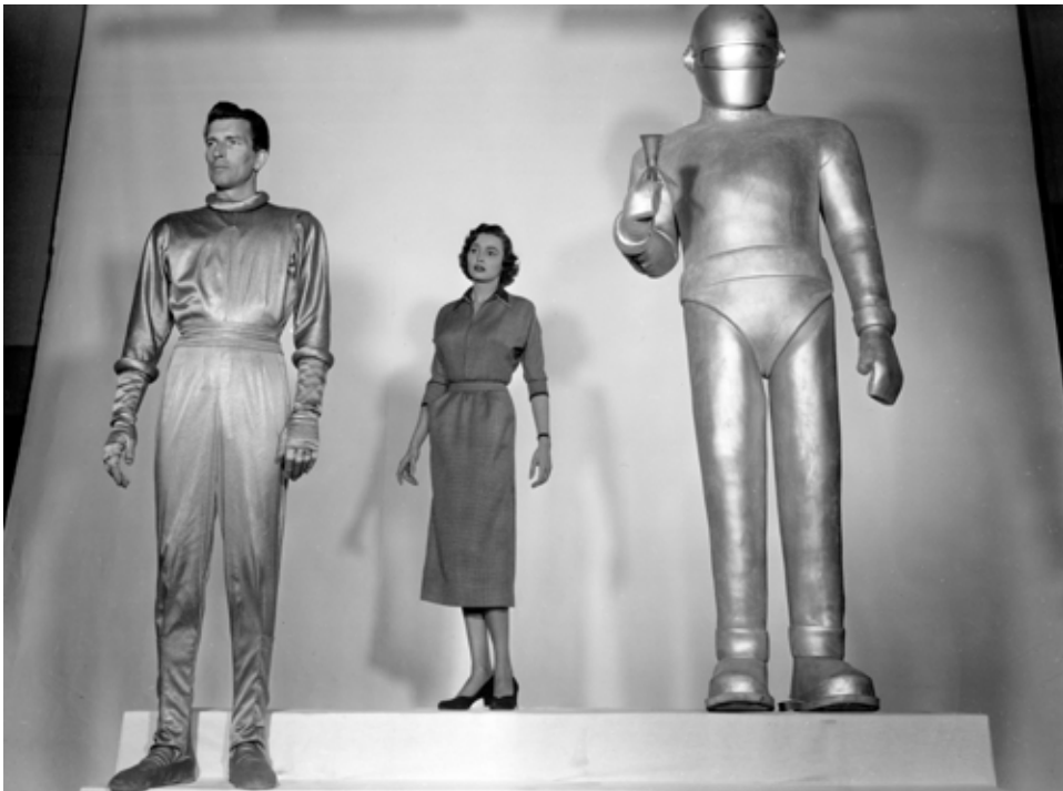
Alien Klaatu (Michael Rennie), left, and Gort (Lock Martin), right, surround human Helen Benson (Patricia Neal).

A spaceship lands in Washington, D.C. A soldier shoots the solo alien occupant as he leaves the craft. Gort, a large and very powerful robot appears to save him and starts destroying things with only the slightest effort. The injured alien orders Gort to stop, and he is then taken to a hospital. The alien escapes, learns about Earth, and even moves in with a family. When they begin to suspect he is not human, he reveals himself as an alien, along with the fact that Gort is a super-robot