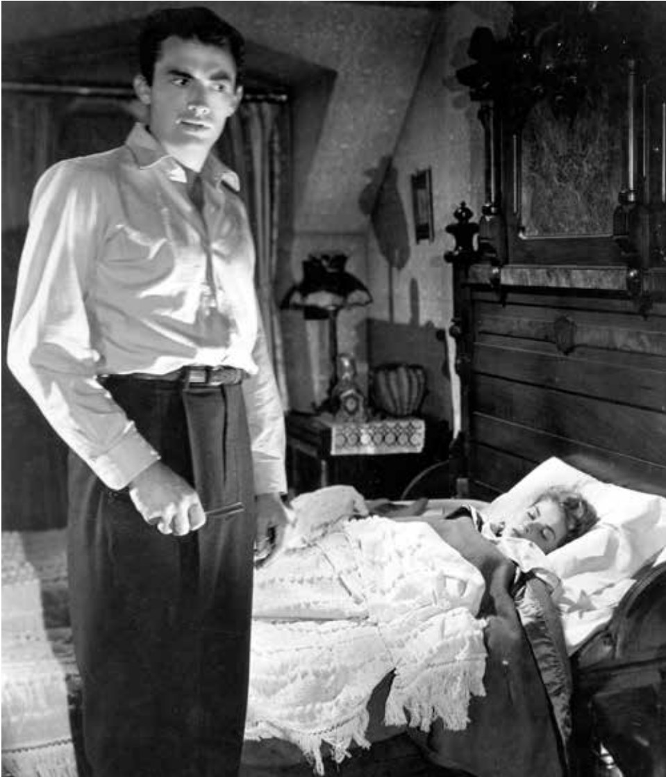
While Dr. Constance Petersen (Ingrid Bergman) sleeps, the tormented John Ballantyne (Gregory Peck) considers their fate.

mental condition. Early in the film, J.B. is visibly disturbed by the sight of dark lines against a white background. Whenever he sees such images, the theremin musically projects his feelings of paranoia.