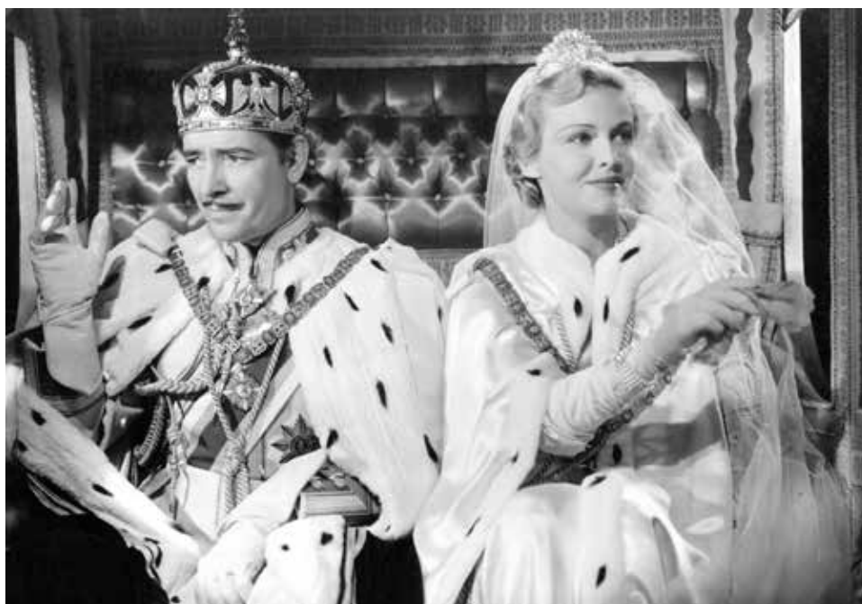
Major Rudolph Rassendyll (Ronald Colman) poses as royalty with Princess Flavia (Madeleine Carroll).

Selznick's newly formed company that consists of a dramatic series of chime tones and orchestral chords.