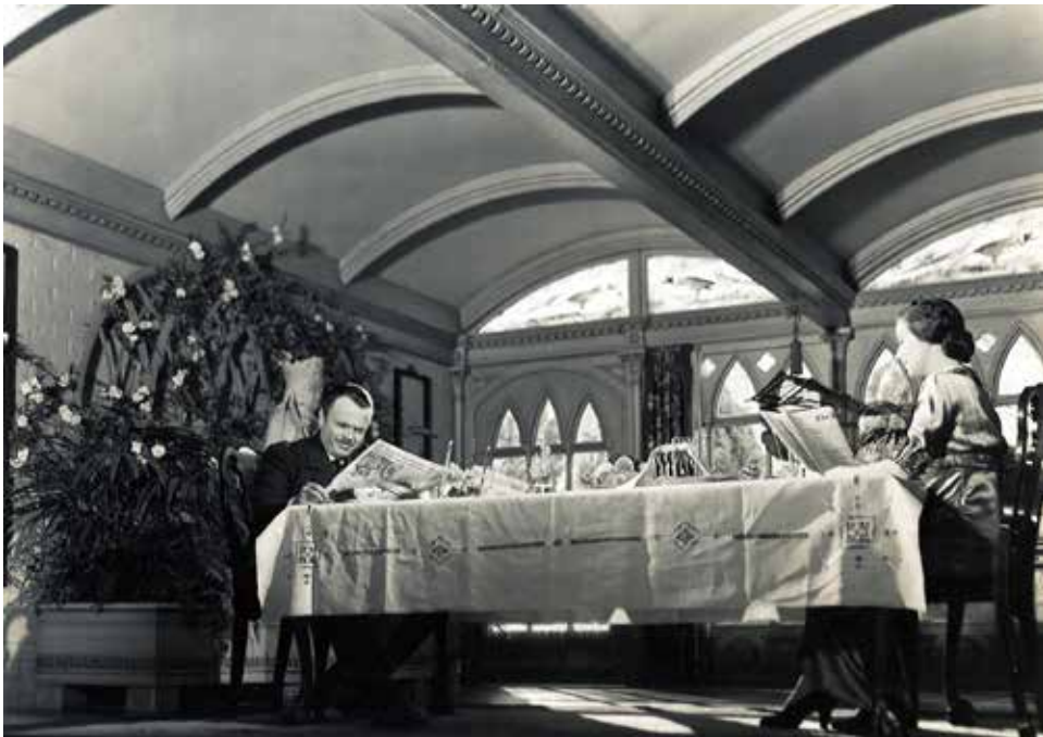
Charles Foster Kane (Orson Welles) and Emily Rose Norton Kane (Ruth Warrick) in a scene that captures the disintegration of their marriage.

Thompson's task leads him first to the archives of Kane's legal guardian, Walter Thatcher (George Coulouris), from which the viewer learns details of Kane's