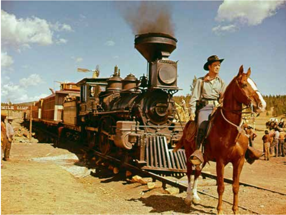
Zeb Rawlings (George Peppard) leads the expansion west.

intervals and an intense energy, but Newman deserves the credit for producing a memorable musical accompaniment to a film truly epic in scale at almost three hours in duration.