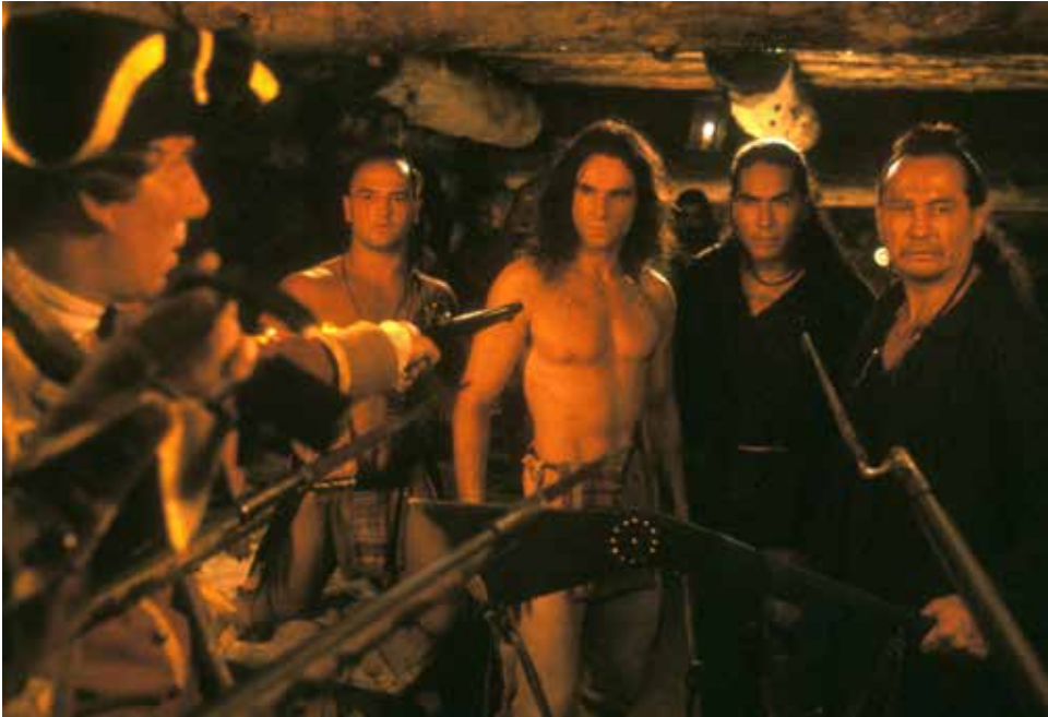
Hawkeye (Daniel Day-Lewis, center), Uncas (Eric Schweig), and Chingachgook (Russell Means, right) confront the British.

bits, and for me to produce a score that I felt worked for the picture. To that end, that's what happened." Jones spoke to Edelman for around ten minutes during the whole process, and while no ill feelings exist, it was far from an ideal situation. This makes it even more remarkable that, together, they composed what is now considered a classic score.