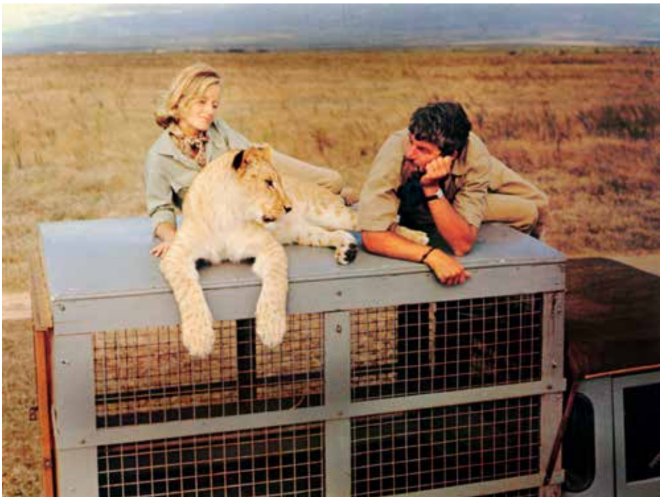
Elsa the lion is flanked by Joy and George Adamson, played by Virginia McKenna and Bill Travers.

The plot sees George Adamson (Travers) bring home three orphaned lion cubs after he is forced to kill their mother in self-defense. When the time comes, the two largest are sent to the Rotterdam Zoo, while Elsa remains with Joy (McKenna). After an unfortunate incident with a herd of elephants, Adamson is given three months to either release Elsa into the wild or send her to a zoo. Much time is spent attempting to reintroduce Elsa to the life of a wild lion, and reluctantly, she is eventually returned to the wild. The Adamsons then return to England. A year later, they fly back to Kenya and discover that Elsa hasn't forgotten them.