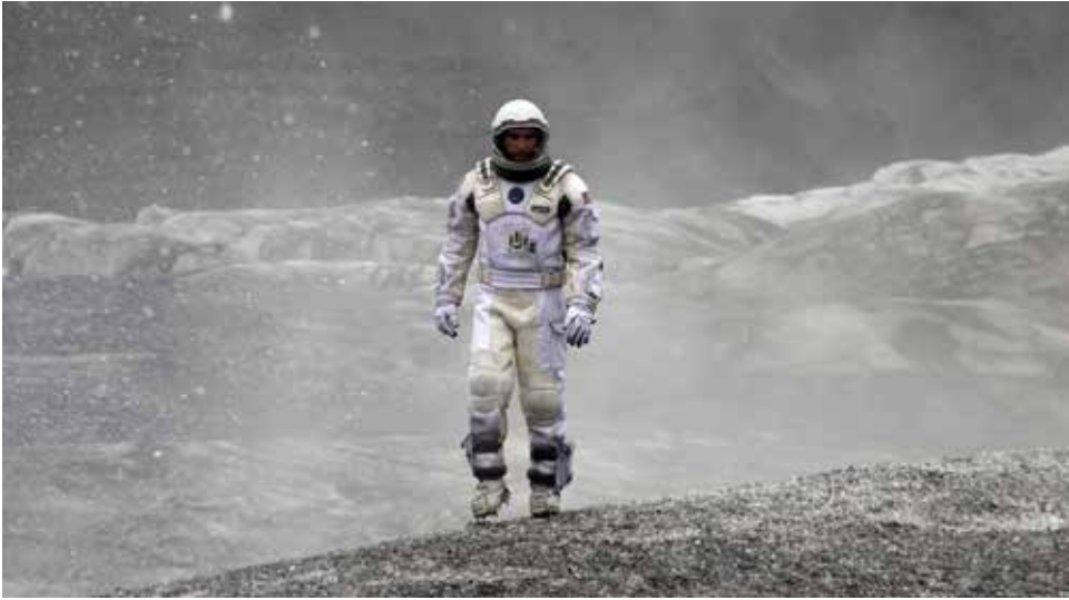
Cooper (Matthew McConaughey) leads a group of astronauts on a mission to save mankind.

thing we sort of created has sort of seeped into other people's movies a bit, so it's time to reinvent. The endless string (ostinatos) need to go by the wayside, the big drums are probably in the bin." After Zimmer had been sent away by Nolan with the envelope and letter, they reconvened. Zimmer recalls the meeting: "I played him the piece, without actually looking at him. As a composer you are very fragile when you play your music for the first time. So I finished, turned around and said, 'What you do think?' He paused and said, 'Well, I suppose I'd better go and make the movie now.' And I said, 'Great, but what is the movie?'" This exchange confused Zimmer, but not Nolan. The director talked of a "vast canvas" for his film, yet Zimmer had composed an intimate piece for a parent-child story (which, incidentally, was kept in its original form for the final credits). The director told Zimmer not to be concerned, as the music provided the heart of the movie, and Nolan's job was to expand that into the epic, almost three-hour space- and time-travel adventure that it became.