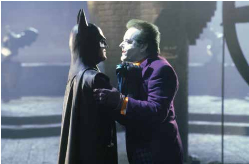
Batman (Michael Keaton) confronts the Joker (Jack Nicholson).

The film is set in the fictional Gotham City during its bicentennial year, where the mayor wants to make the city safer. Batman, a vigilante who targets the city's criminals, is investigated by journalist Vicki Vale (Kim Basinger), and Bruce Wayne, Batman's alter ego, begins a relationship with her. Batman continues to fight crime in the city, but soon meets a more deadly foe in the Joker (Jack Nicholson). The Joker lures Vale into a trap, but Batman arrives to rescue her. Later it is revealed that the Joker was the mugger who killed Wayne/Batman's parents years ago. Batman eventually defeats the Joker, and peace is restored, temporarily, to Gotham City.