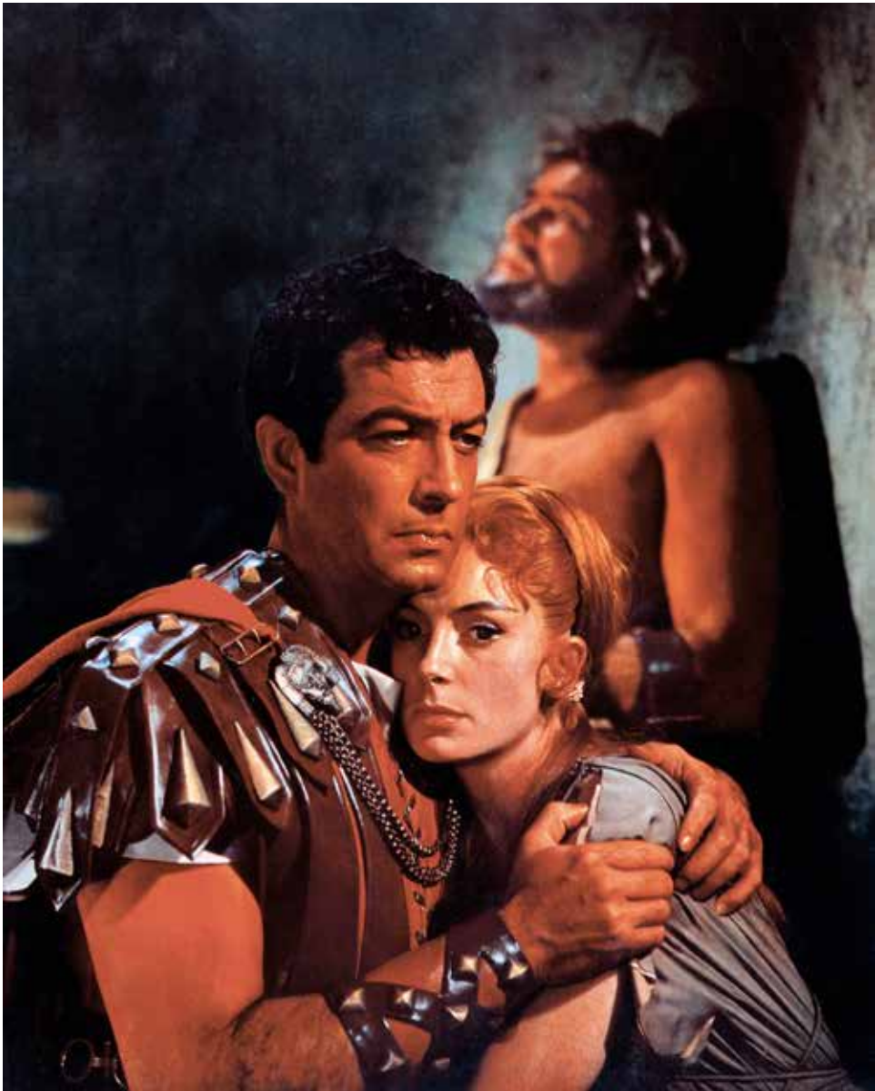
Roman commander Marcus Vinicius (Robert Taylor) has fallen in love with Lygia (Deborah Kerr), a devout Christian.

The first Dorian idea appears in the opening credits, where a trumpet fanfare is followed by a dramatic sounding of a five-note motif that is associated with the Romans. This is soon followed by the choral singing of the words “ Quo vadis, Domine, ” which is based on a six-note motif that reflects the Christian element in the film.