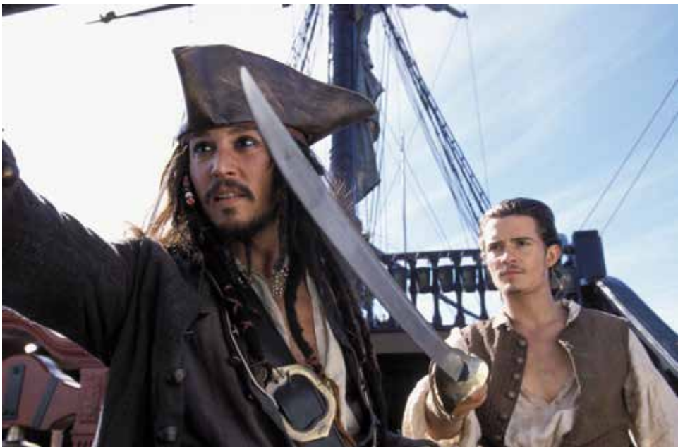
Johnny Depp as Jack Sparrow and Orlando Bloom as Will Turner.

Elizabeth learns that after the Black Pearl's crew stole cursed treasure, they were forced to bear the curse of undeath, appearing as decomposed corpses in the