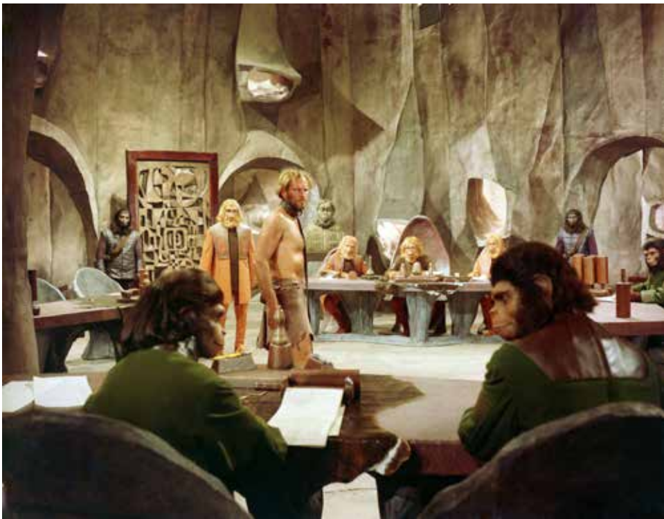
Human George Taylor (Charlton Heston, center) is on trial, while in the foreground Zira (Kim Hunter) and Cornelius (Roddy McDowall) plead his case.