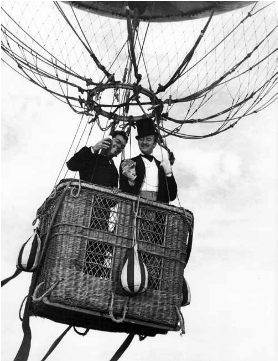
Cantinflas and David Niven in a hot air balloon, one of their modes of transportation.