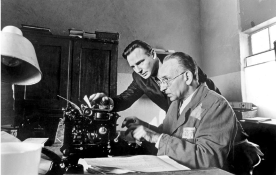
Itzhak Stern (Ben Kingsley) and Oskar Schindler (Liam Neeson) compiling their list.

Sometimes film music by itself is as recognizable and revered as the film it accompanies. John Williams's heartrending solo violin theme to Schindler's List is arguably one such piece. Performed by the Israeli-American violinist Itzhak Perlman, the evocative melody was undoubtedly the key contributing factor to Williams winning his fifth (and, at the time of writing, latest) Academy Award for Best Original Score. The theme has been appropriated in a number of ways, including by figure skaters for their routines, such is the prominence of the melody in wider society.