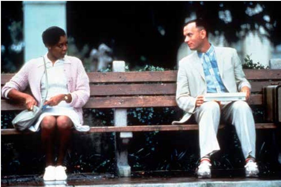
Forrest (Tom Hanks) regales fellow commuter (Rebecca Williams).

Silvestri wrote the “Feather Theme,” the film’s main-title idea, very early in the process, and he completed it in only fifteen minutes. The director had asked for something that captured the essence of the film. Silvestri saw an early mock-up of the film where the feather was actually in the director’s hand, but from that, he established the memorable, gentle melody that opens the film and reappears only once at the end. As the feather falls from the sky, a solo piano begins in a high register to play the poignant melody. As it finds its way closer to Forrest, the rest of the orchestra begins to join in, adding an emotive depth to the theme. In an interview with BMI explaining his compositional process, Silvestri stated that he tried to insert the “Feather Theme” into almost every scene in the film where music was required, but it just did not work. For each scene that came up, a new cue or theme had to be written. Only when the feather returned at the end of the film could he reuse what is arguably the most well-known melody from the score.