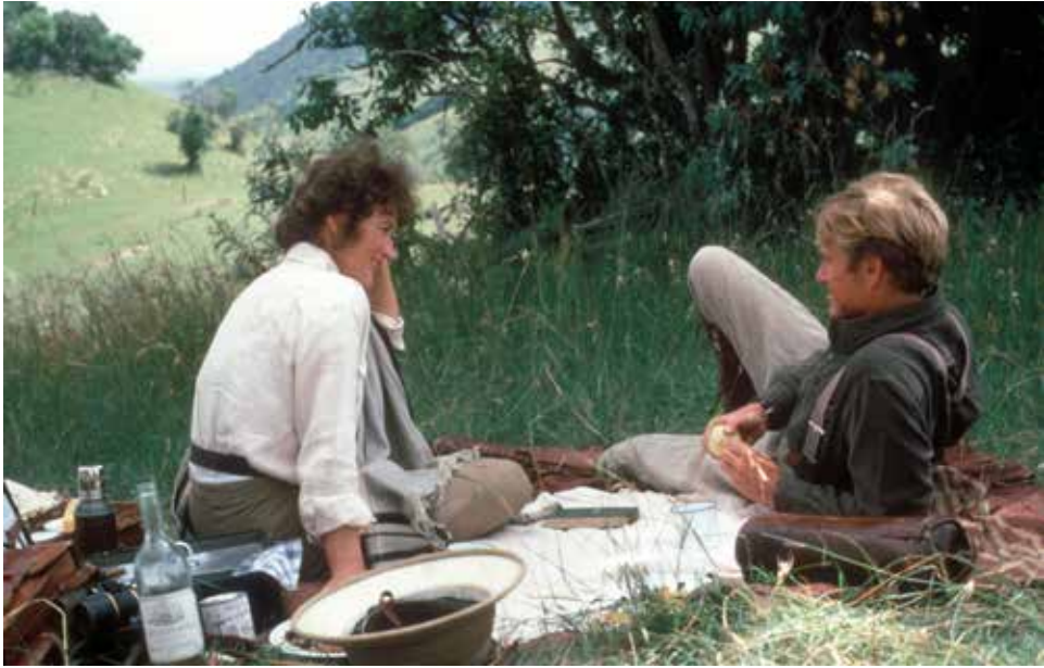
Karen Blixen (Meryl Streep) and Denys Finch Hatton (Robert Redford).

French horn in film scores, and it is nowhere more evident than in his two “Africa” films Born Free and Out of Africa . The horns seem to glide above the strings, before the strings reassert themselves by taking on the second section of the main melody. The horns become an instrument of counterpoint, interjecting the main melody with a beautiful, searching counter melody.