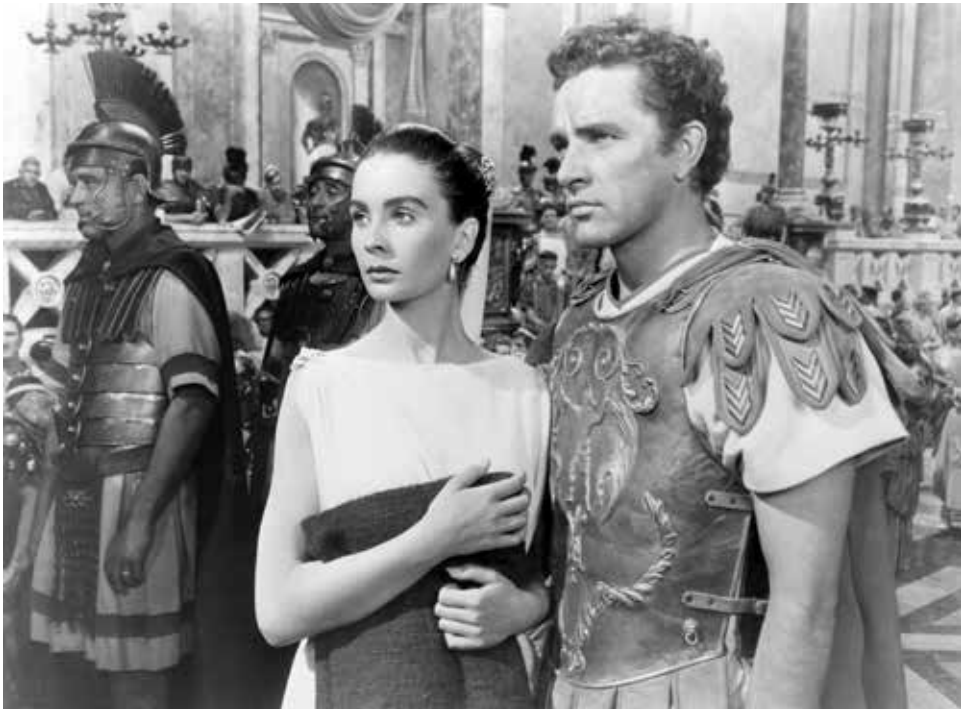
Diana (Jean Simmons) and tormented tribune Marcellus Gallio (Richard Burton).

Douglas's story, set in the first century, concerns a Roman tribune named Marcellus Gallio (Richard Burton), the son of a Roman senator, who is assigned