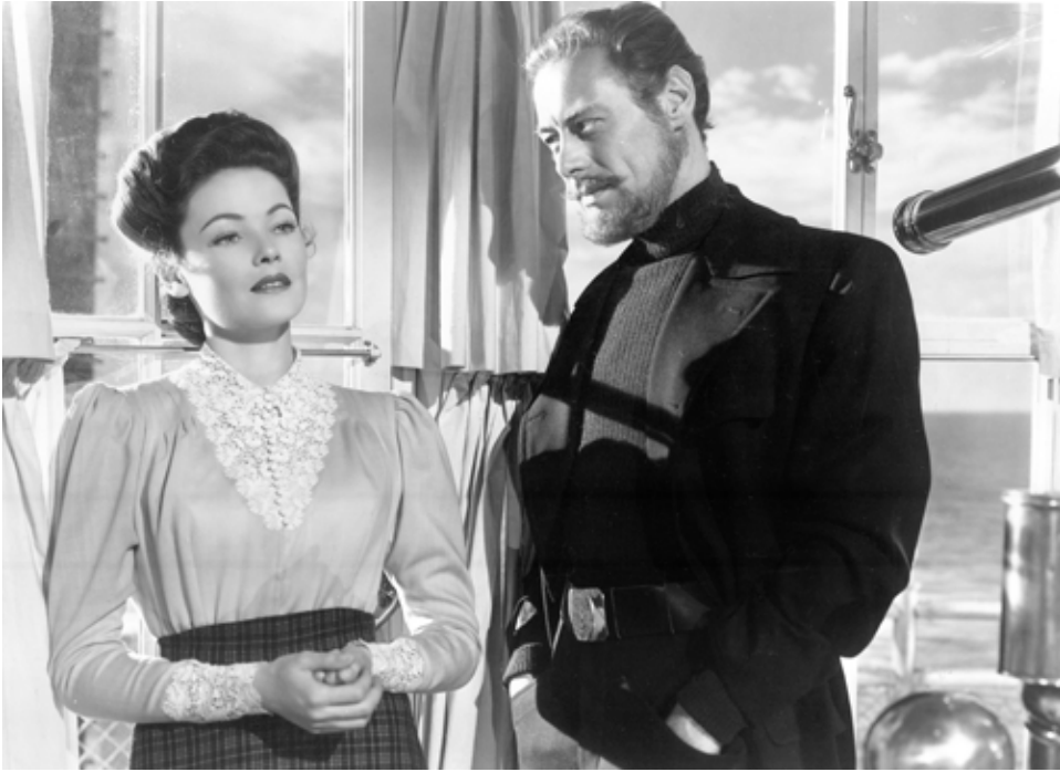
Lucy Muir (Gene Tierney) and the deceased Captain Gregg (Rex Harrison).

This mysterious aura is evident in the opening credits, where pairs of woodwinds sound the first of three distinct ideas that serve as important thematic motifs. These fast-moving rising tones are followed by a slower-paced four-tone string idea that begins with an ascending leap. Herrmann's combining of these motifs suggests the continual ebb and flow of the incoming waves. There is also a motif for strings and harp with four melodic tones that smoothly descend in pitch. This third idea is used as the basis for Lucy's theme, which arrives immediately following the credits. The lilting music represents both Lucy's loving nature and an inner strength that allows her to confront ghosts.