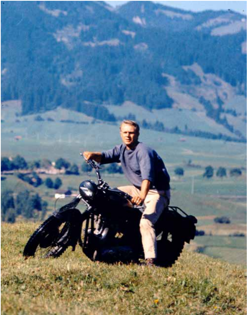
Captain Virgil Hilts (Steve McQueen) attempting to cross into Switzerland.