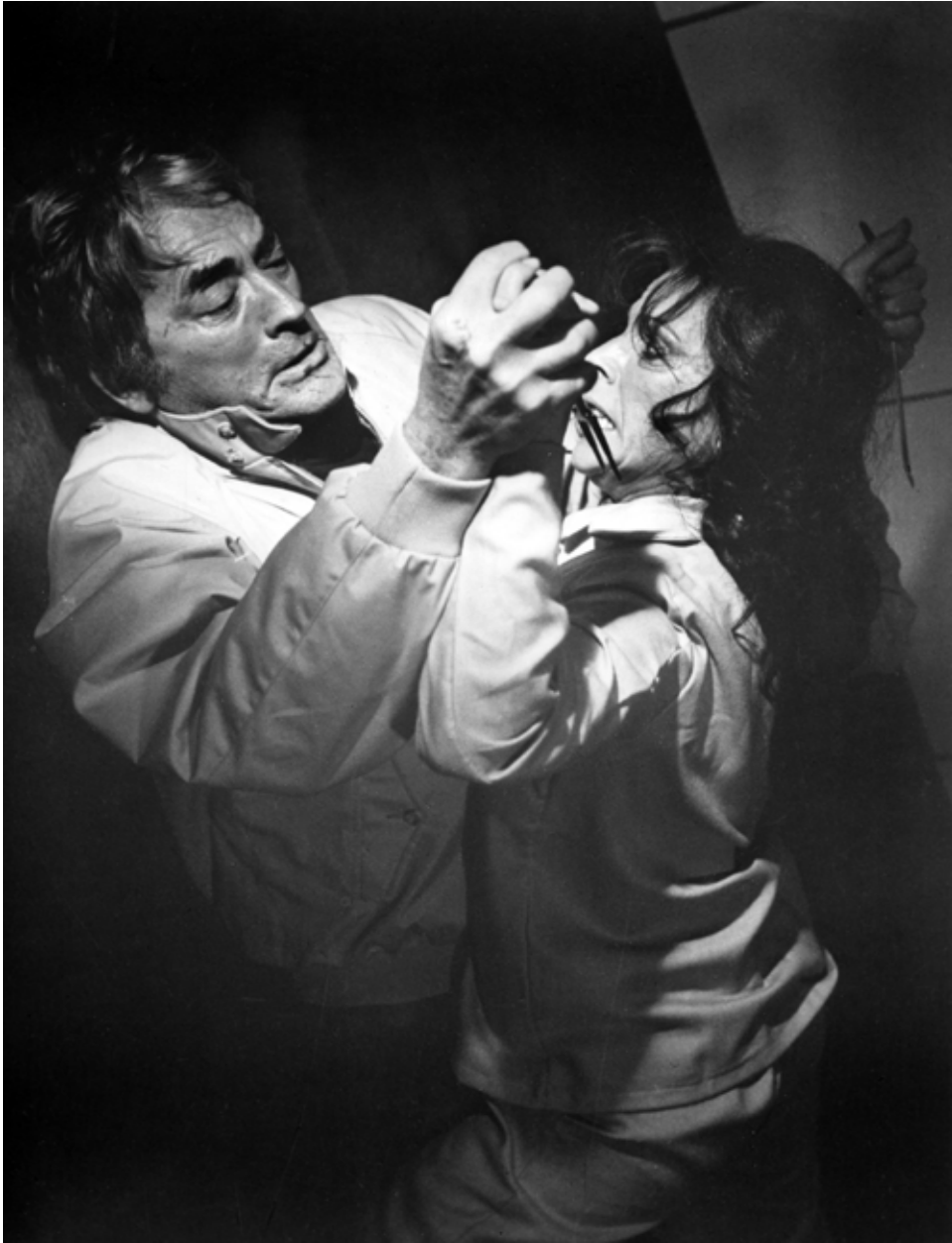
Robert Thorn (Gregory Peck) grapples with the devil's emissary Mrs. Baylock (Billie Whitelaw).

between them and the child, who they do not immediately realize is the devil or antichrist. The poignancy of Robert Thorn first losing his wife and then the child he has grown to love is heightened by Goldsmith's established love theme. It is evidence that horror movies are most successful when a balance is struck and