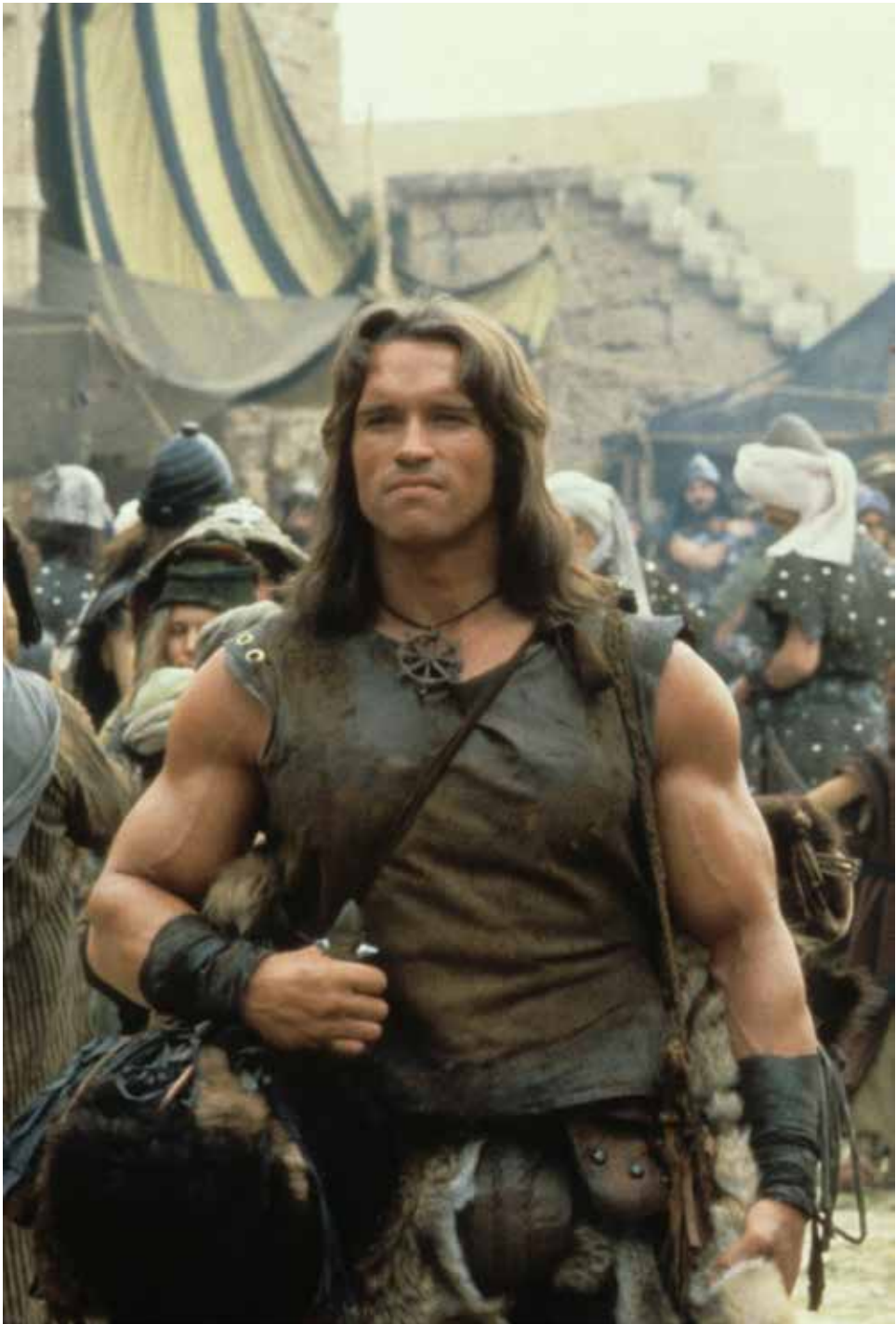
On the verge of stardom: Arnold Schwarzenegger as Conan.