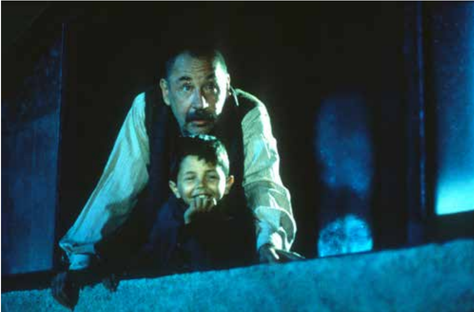
Projectionist Alfredo (Philippe Noiret) and his young apprentice (Salvatore Cascio).

progresses in a smoothly flowing way, with more upward leaps and rhythmic pauses inserted as the theme reaches its conclusion.