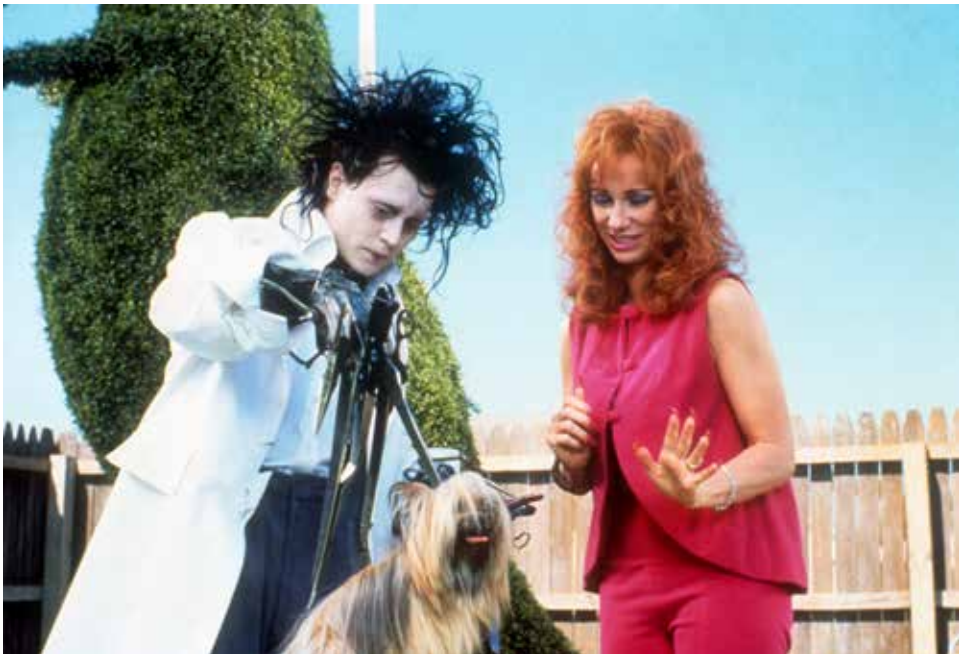
Joyce (Kathy Baker) watches Edward Scissorhands (Johnny Depp) make magic with his hairdressing skills.

Edward lives alone in the inventor's old mansion atop a mountain that overlooks a suburban housing development. Peg Boggs (Dianne Wiest), who lives in the suburb with her family, canvasses the neighborhood as an Avon lady, but has little luck selling her products to her neighbors. One day she impulsively drives up to the mansion to find new customers. When Peg meets Edward his appear-