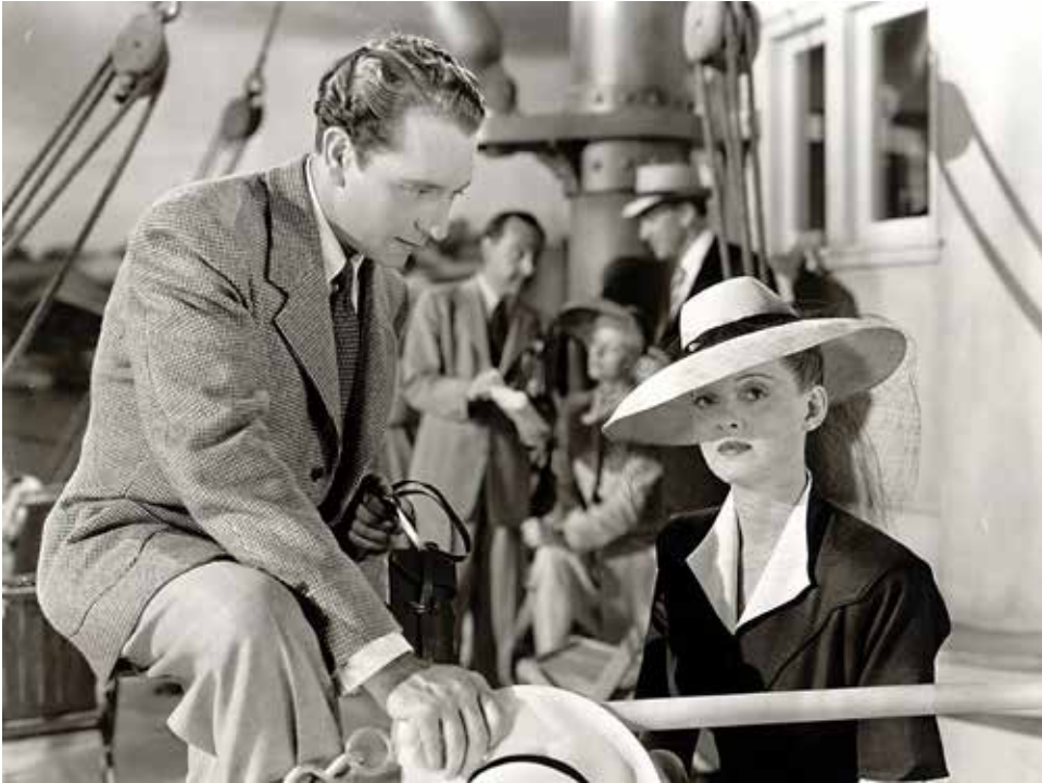
On a cruise to South America, Jerry Durrance (Paul Henreid) meets transformed spinster Charlotte Vale (Bette Davis).