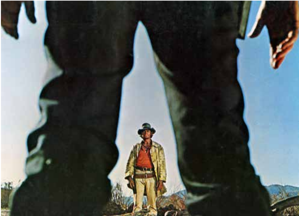
Harmonica (Charles Bronson) in a showdown.

In the violent fictional town of Flagstone in the Wild West, a husband is joined by his new wife, a prostitute. Unfortunately, she finds him murdered upon arrival and enlists the help of a mysterious man to help solve the crime. This man, both a marksman and harmonica player, sets out to find the unknown murderer. It is revealed that a man by the name of Frank is the suspected killer, and the man with the harmonica, along with the outlaw Cheyenne, search for him in pursuit of justice. The film was not nominated for any major awards; a fact that seems inconceivable given its reception and cult status since its release.