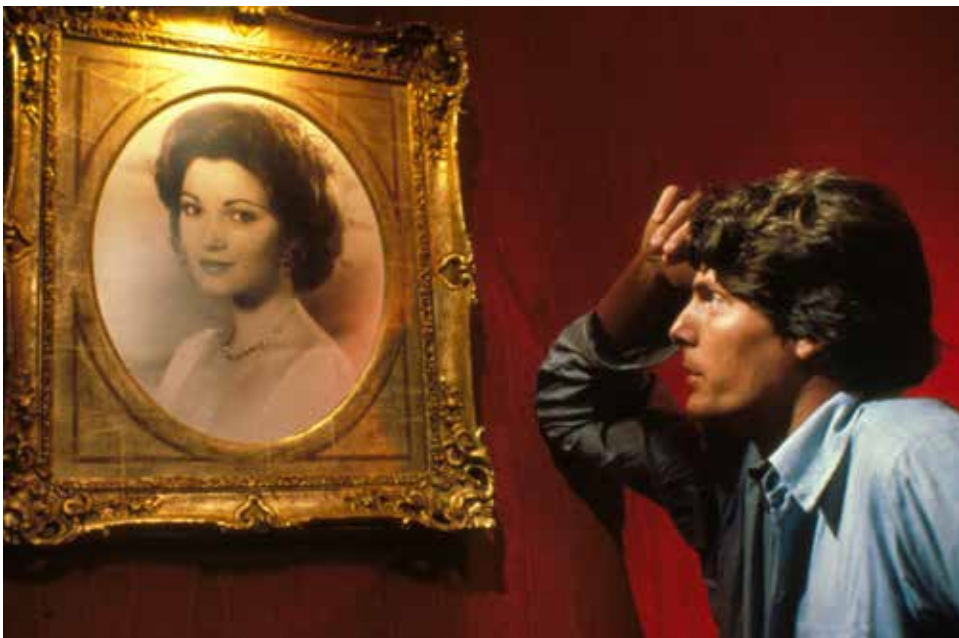
Christopher Reeve gazes upon Jane Seymour's portrait.

Richard succeeds in finding Elise and they fall in love almost instantly, but like Rick and Ilse in Casablanca , huge obstacles stand in the way of a lasting relationship.