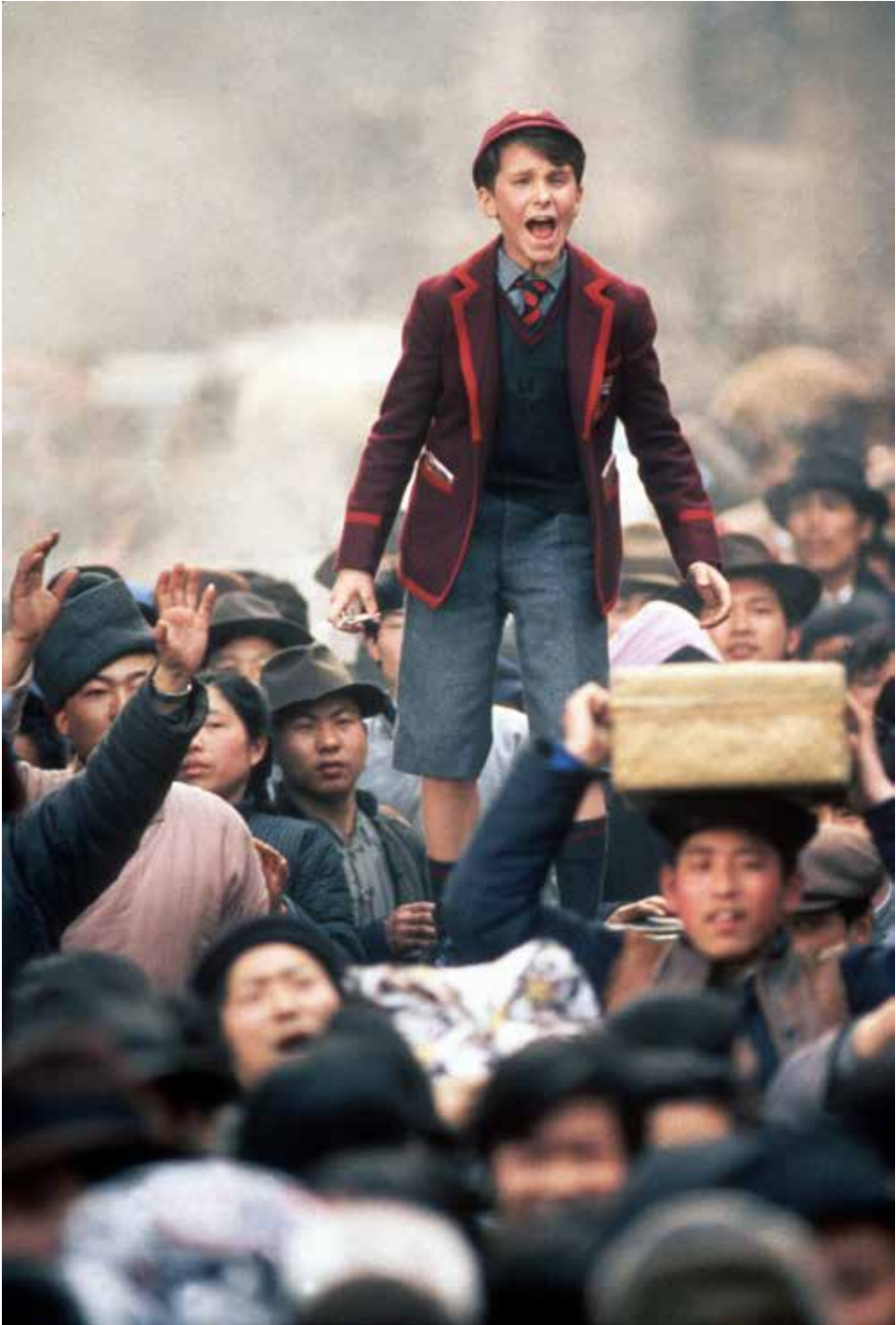
A very young Christian Bale.