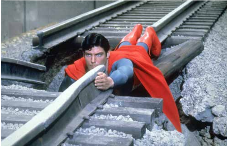
Superman (Christopher Reeve) saves the day again!

The movie begins on Krypton, where Superman's father sends him off to Earth as a young child. He grows up to be a newspaper reporter named Clark Kent but has an alter ego, Superman. When the evil Lex Luthor plans to take over the world, Superman is the only one who can stop him. The film was nominated for four Academy Awards, of which it won one, a Special Achievement Award for visual effects. The nominations were for Best Sound, Best Editing, and Best Original Score. It also received nominations for five BAFTAs, winning one for Most Promising Newcomer (Christopher Reeve), and one Golden Globe for Best Original Score.