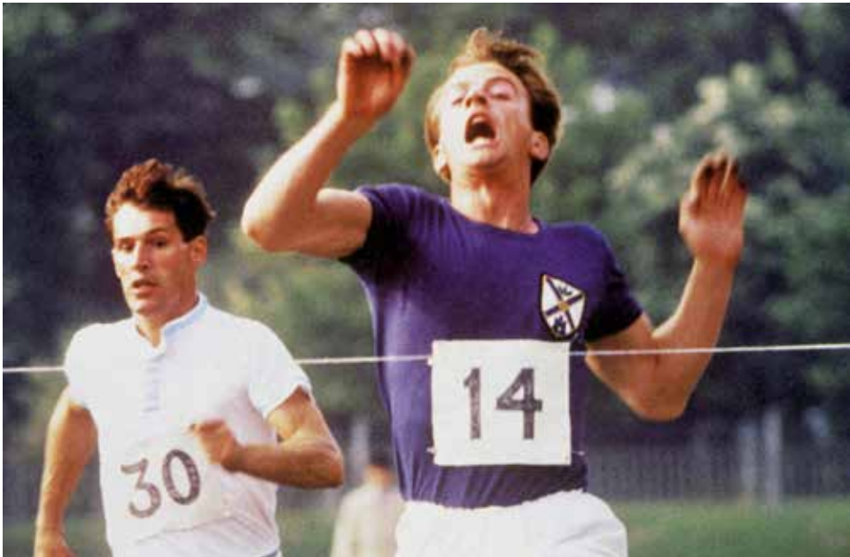
Olympic contenders Harold Abrahams (Ben Cross) and Andrew Lindsey (Nigel Havers).

The narrative, told in flashback, focuses on two British sprinters at the 1924 Olympic games. Harold Abrahams (Cross) and Eric Liddell (Charleson) are Jewish and Christian respectively, and the film follows their stories as their paths cross and diverge again. Tragically, the real-life Liddell died in a Japanese prison camp in 1945. Abrahams lived until 1978, when the last remaining member of the 1924 Olympic team read a eulogy at his funeral.