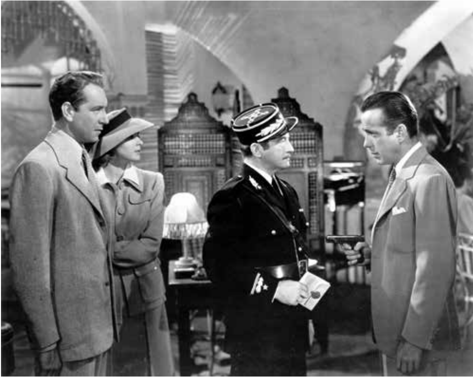
From left: Paul Henreid, Ingrid Bergman, Claude Rains, and Humphrey Bogart.

In Casablanca , Steiner had to take music already built into the drama of the film and use it to manufacture an appropriate musical score. As Scheurer explains, on-screen (diegetic) popular song in the film was a “force Steiner could not deny.” Songs sung by characters became a dominating factor, and Steiner’s score had no choice but to work with these songs and adapt them into his own writing. For this reason, continues Scheurer, it might not actually be considered a classic Steiner score in its own right. But it more than deserves its place in the top 100 for the way in which the popular music and classical film score intertwine to create a meaningful whole. Three songs were fundamental to Casablanca ’s score: “As Time Goes By,” “Deutschland Über Alles” (the German national anthem), and “The Marseillaise” (the French national anthem). Steiner weaves these themes into his orchestral underscore, complementing their dominant on-screen appearances with a subtler underscore presence.