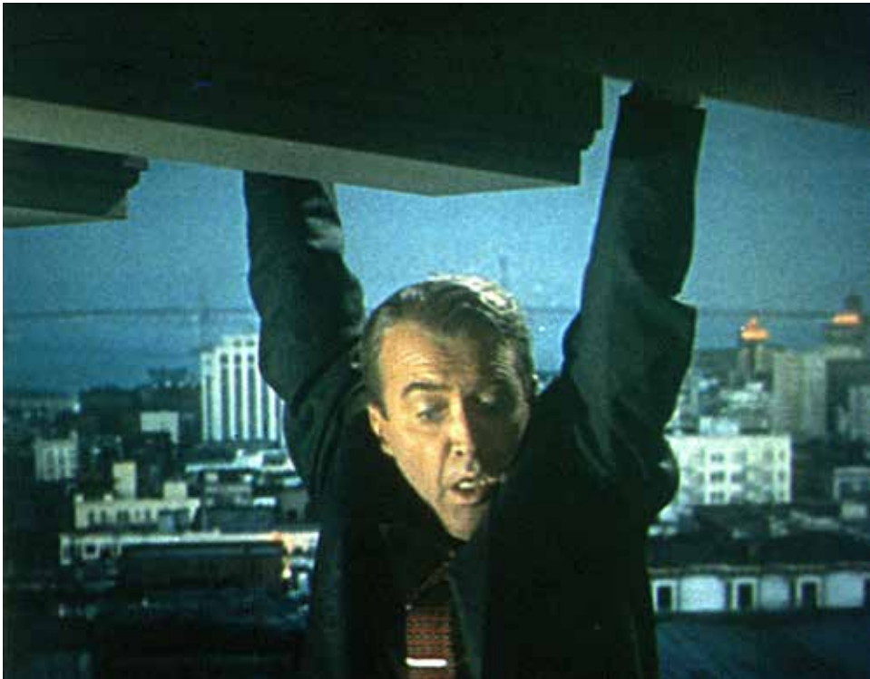
Detective John "Scottie" Ferguson (James Stewart) hangs by a thread in the opening moments of Vertigo.

The opening scene includes turbulent music for a nighttime chase that ends with the death of a policeman who falls while trying to rescue Scottie, who is dangling from a roof gutter. The music gets especially dramatic when Scottie looks down. Loud harp arpeggios and muted trumpet tones add to the impact of this brief motif. Both the chase music and the vertigo motif recur later in the film.