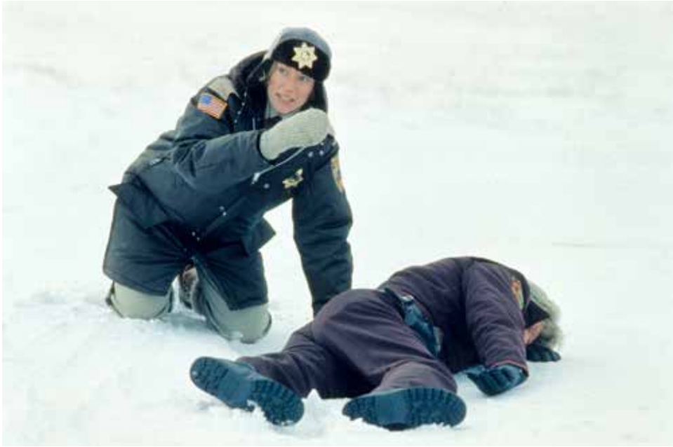
Frances McDormand in her Academy Award–winning role of Marge Gunderson.